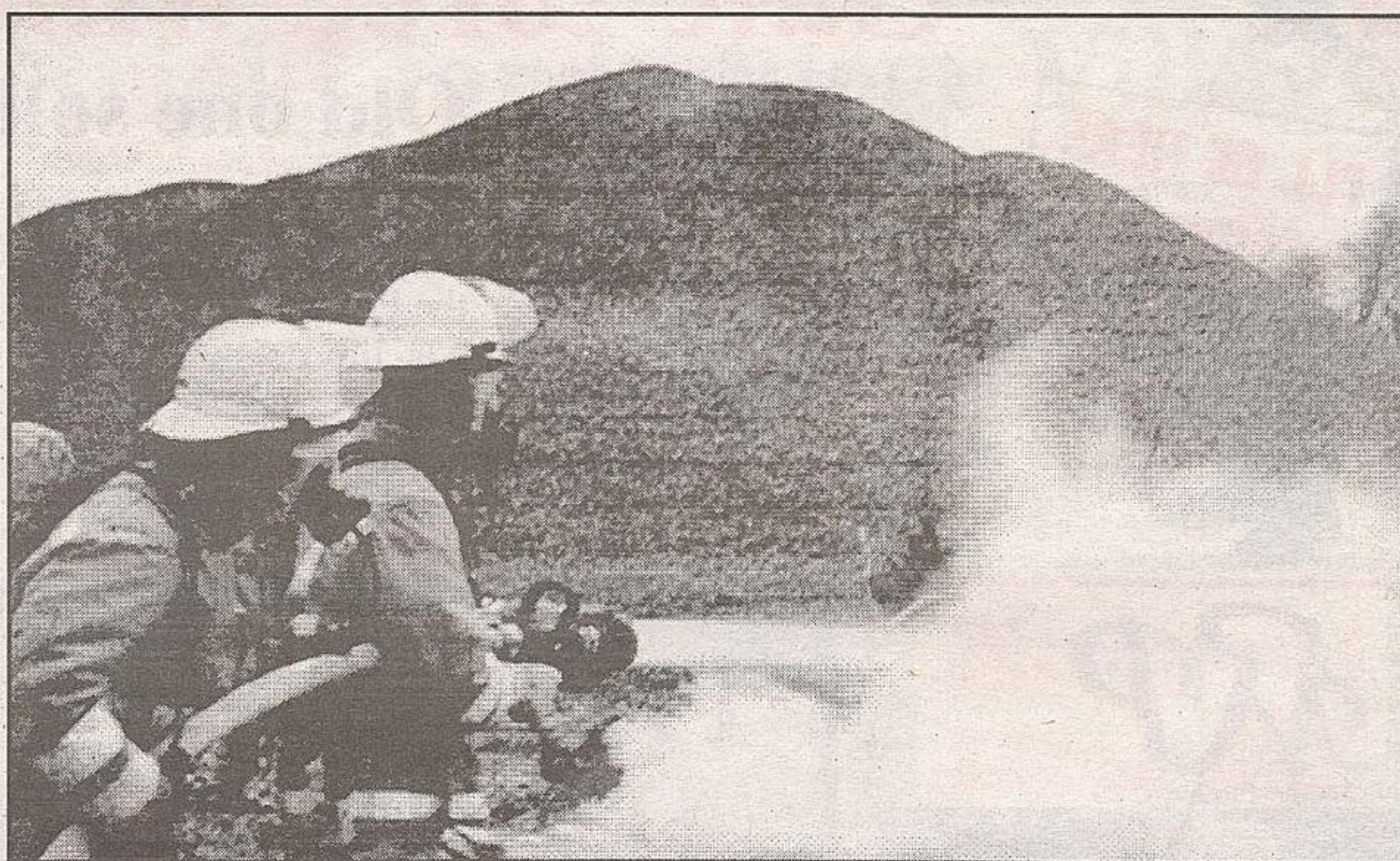
HOT STUFF: The Acton detachment of the Halton Hills Fire Department was called to a debris fire Saturday at the Ospringe Pit of Mulmur Aggregates on Highway 25 North.