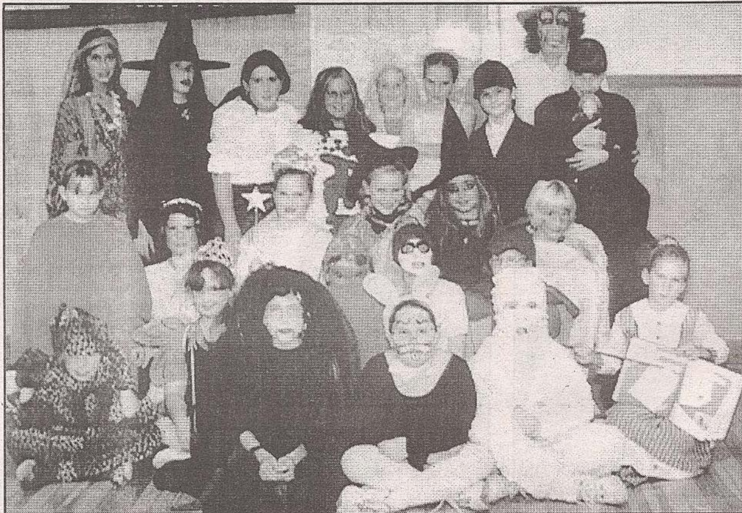
GHOULISH GUIDES: Members of the 3rd Acton Guides traded their uniforms for costumes to celebrate Hallowe'en last Wednesday.