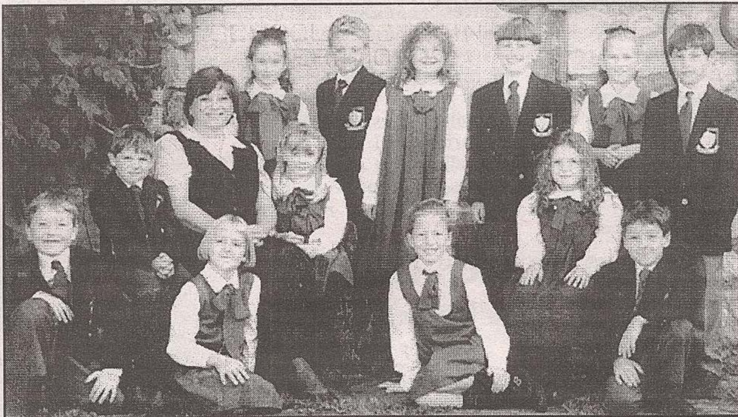
EAGER STUDENTS: Parents of students at Rockwood's Wellington Hall Academy private school appreciate the focus on academics and small class sizes.

"We are involved presently in organizing and en-