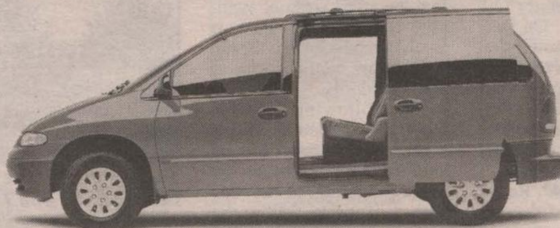
1998 Dodge Caravan/Plymouth Voyager 26T Family Value Package

0% † financing OR LEASE FOR $198 † a month for 36 months. Plus $1,778 downpayment or equivalent trade, $250 security deposit and $855 freight.