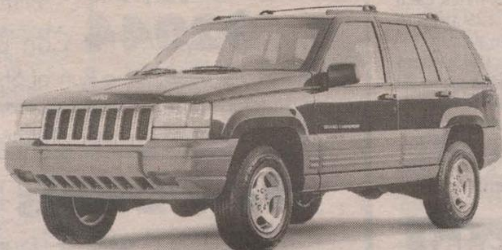
1998 Jeep Grand Cherokee Laredo 26E Package

0% † financing OR LEASE FOR $328 † a month for 36 months. Plus $4,637 downpayment or equivalent trade, $400 security deposit and $715 freight.