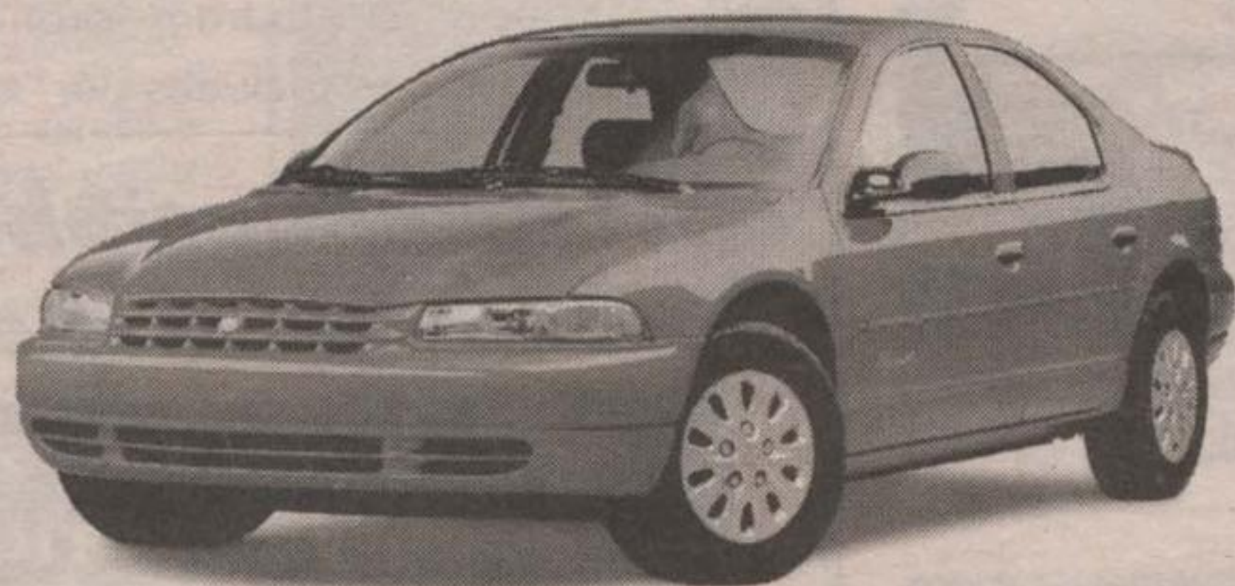
1998 Plymouth Breeze/Dodge Stratus 24A Package

0% † financing OR LEASE FOR $219 † a month for 36 months. Plus $3,081 downpayment or equivalent trade, $275 security deposit and $715 freight.