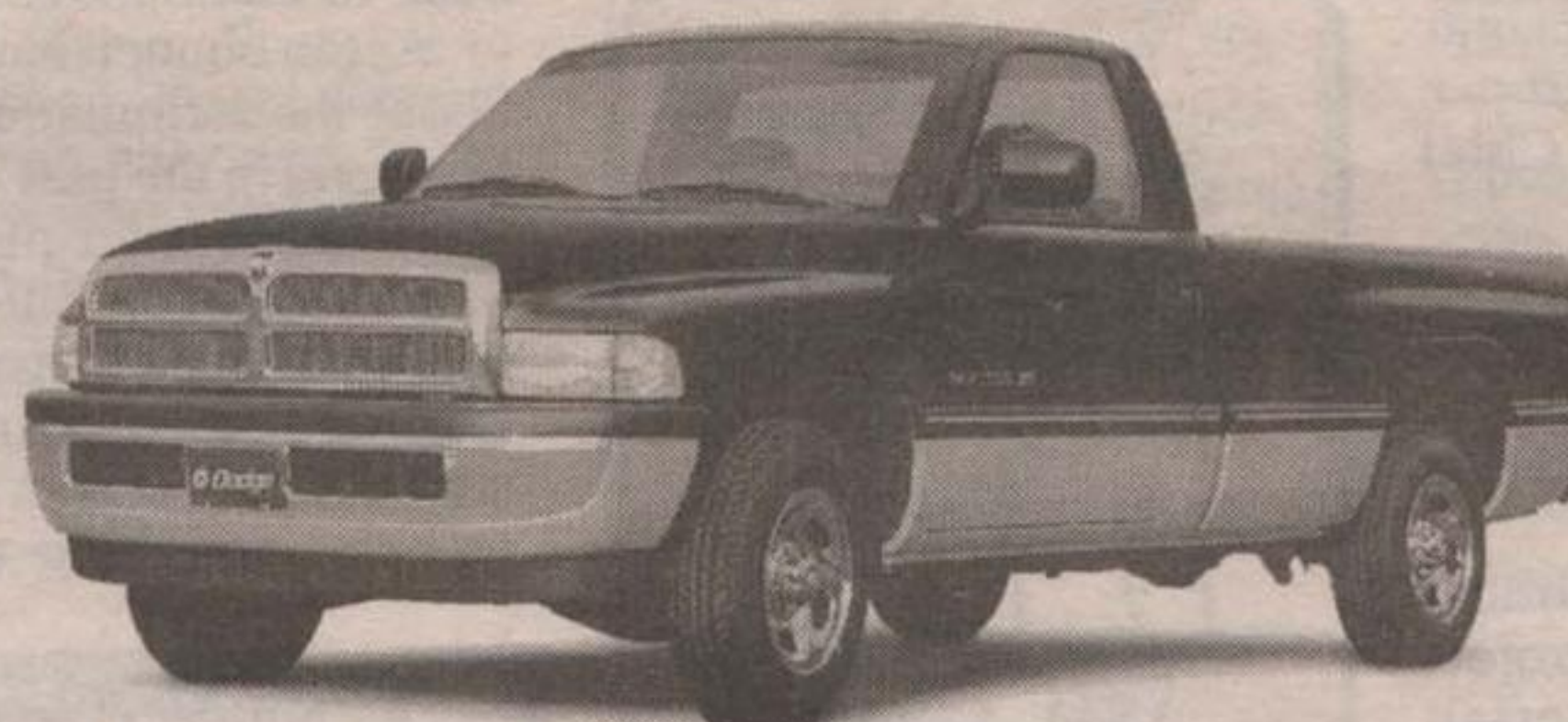
1998 Dodge Ram ST 4x2 24A Package

0% † financing OR LEASE FOR $198 † a month for 36 months. Plus $3,178 downpayment or equivalent trade, $250 security deposit and $920 freight.