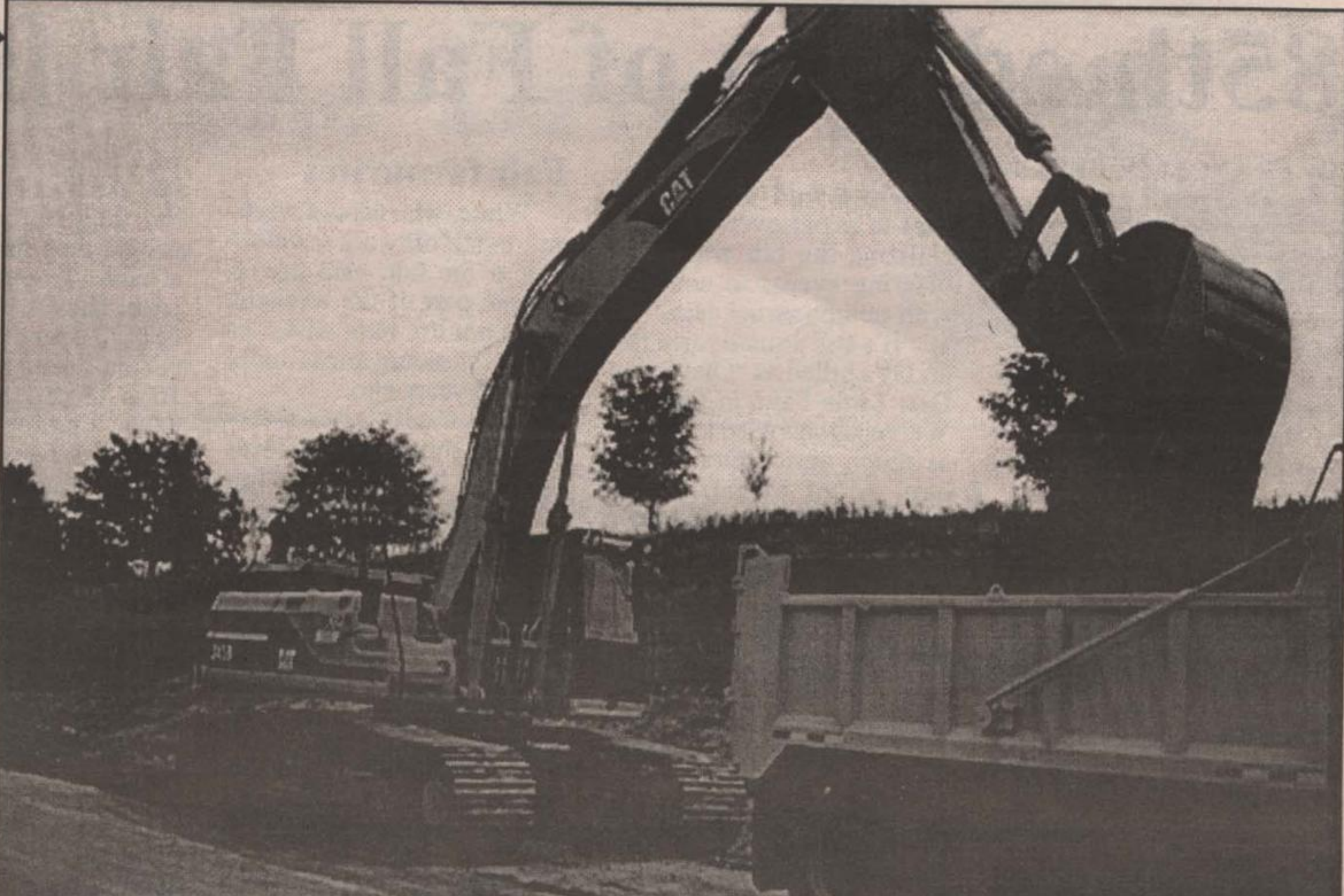
BETTER ROADS: Nellis Construction of Acton has equipment, including this big backhoe, working on improvements to old Highway 25 north of Acton.