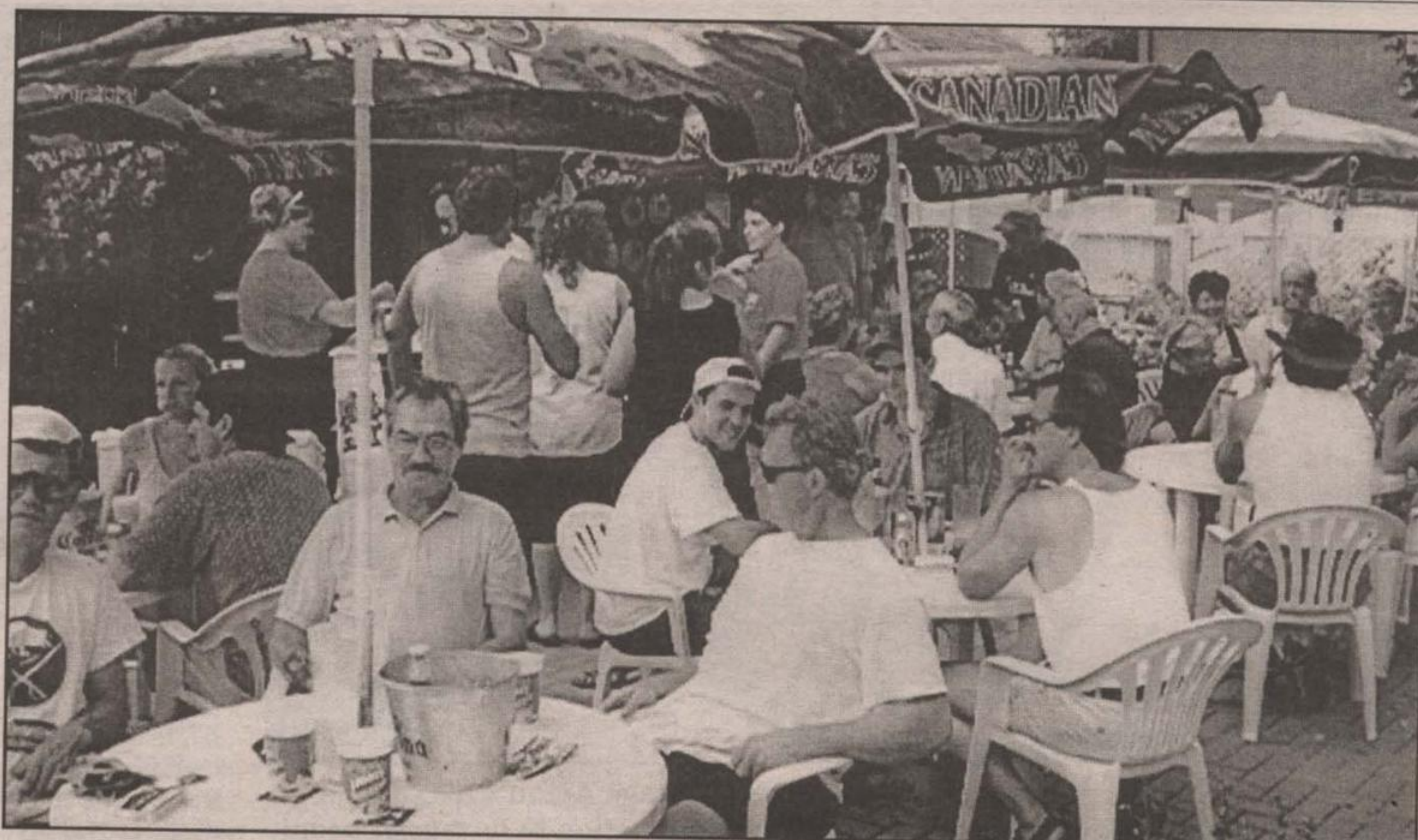
STANDING ROOM ONLY: Local businesses enjoyed the large crowds at Sunday's Leathertown Festival including the Red Dog Café which was filled to capacity.