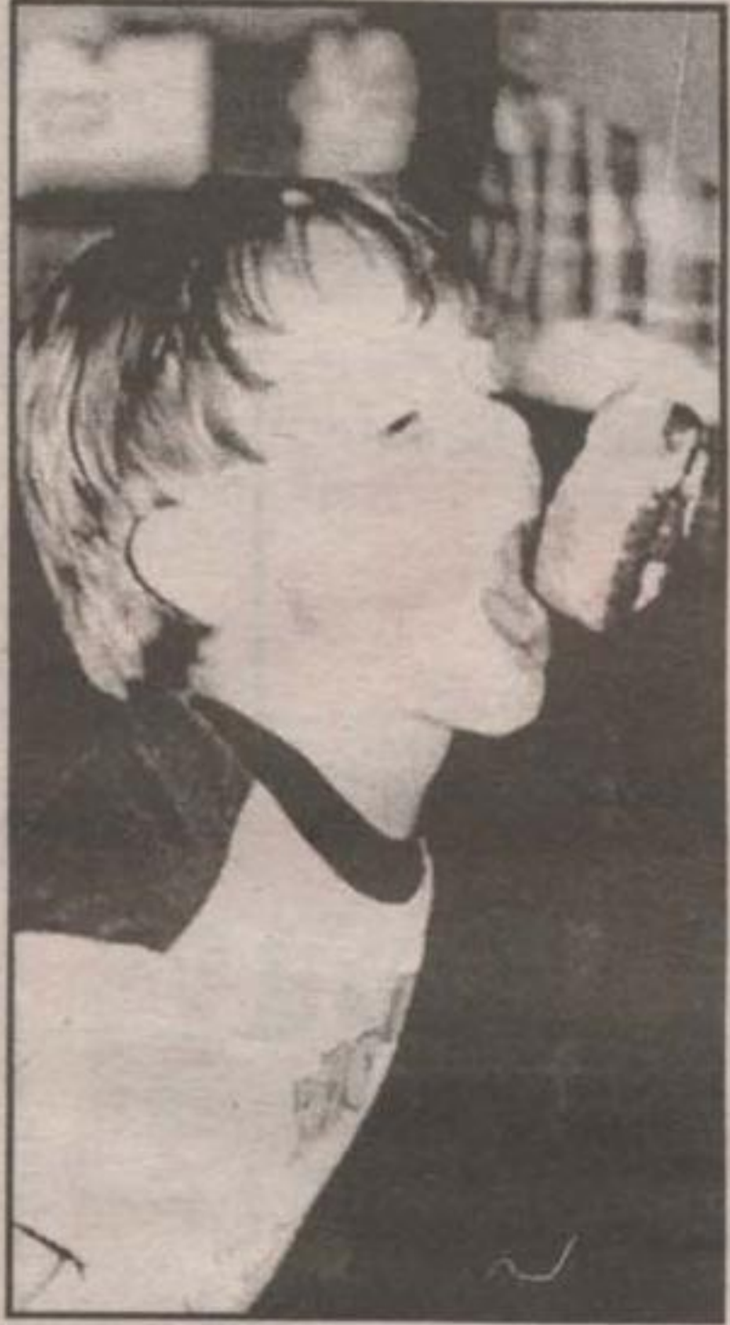
I AM SO HUNGRY: Some carnival goers tried a new version of bobbing for apples with a new game grabbing a donut hanging from a string.