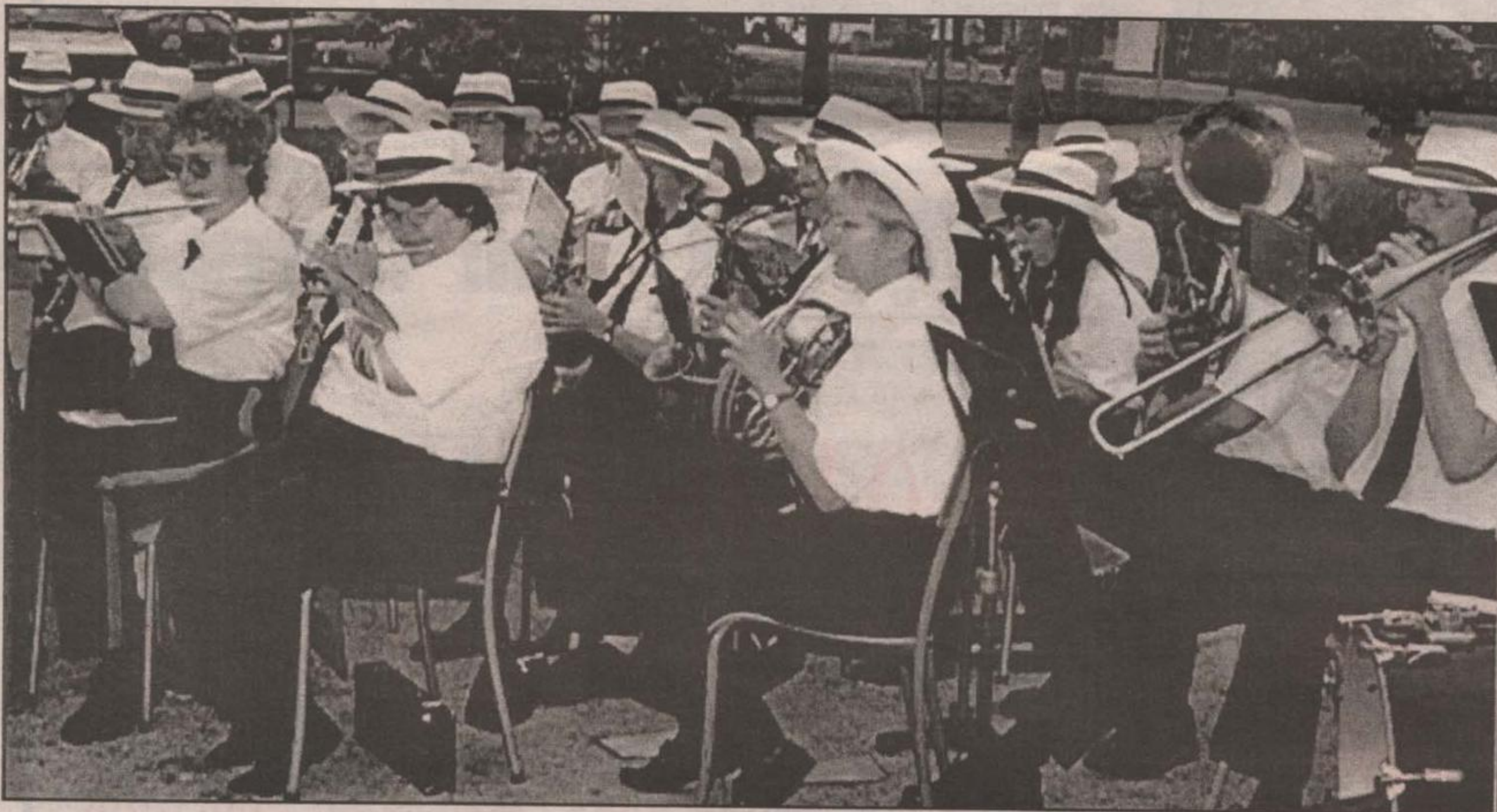
A MUSICAL INTERLUDE: Acton Citizens' Band entertained at the Trunk Sale Saturday. Band members played through cloudy skies and small showers for their audience and promised to return again this summer.