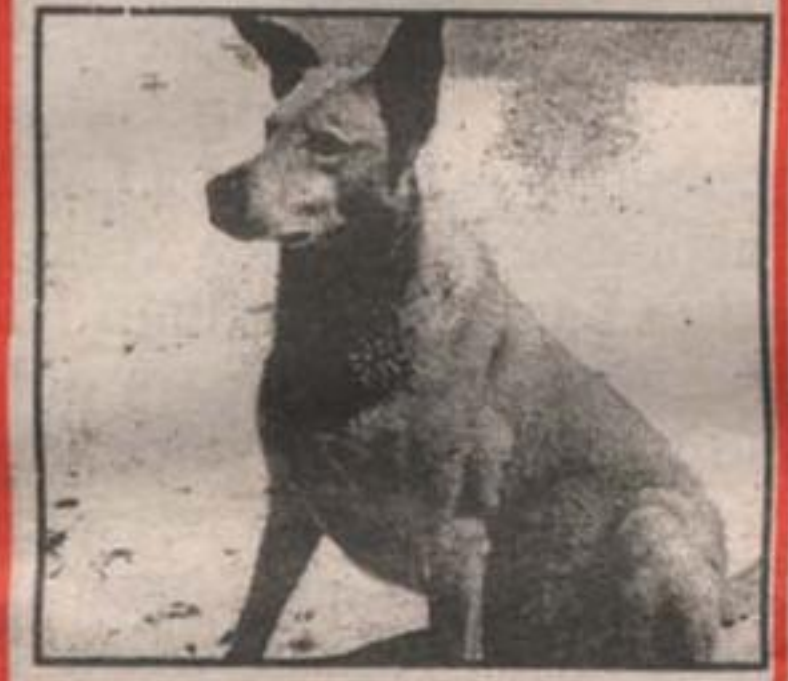
What, a singing dog? Yep, right here in Halton Hills. See story on Page 2.