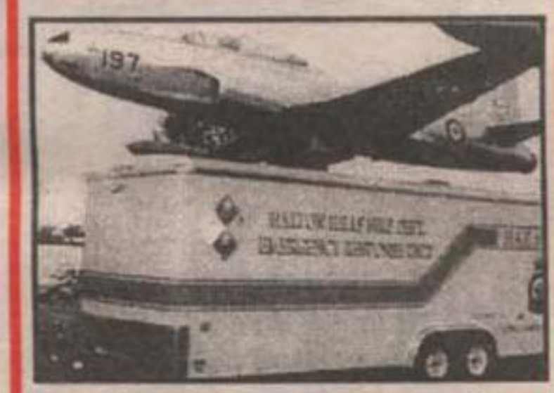
The Royal Canadian Legion presented a new trailer to Halton Hills emergency response unit. See Page 8.