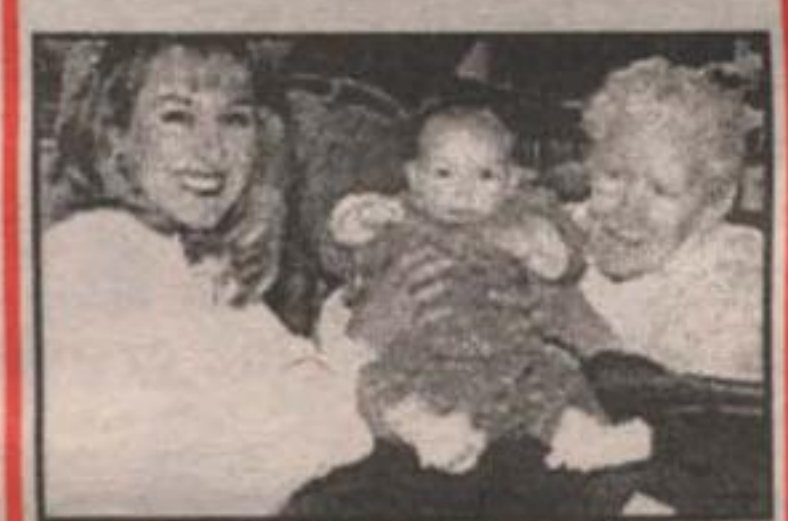
An Intergenerational Luncheon was held at the band hall on June 1. See Page 10 for photos.