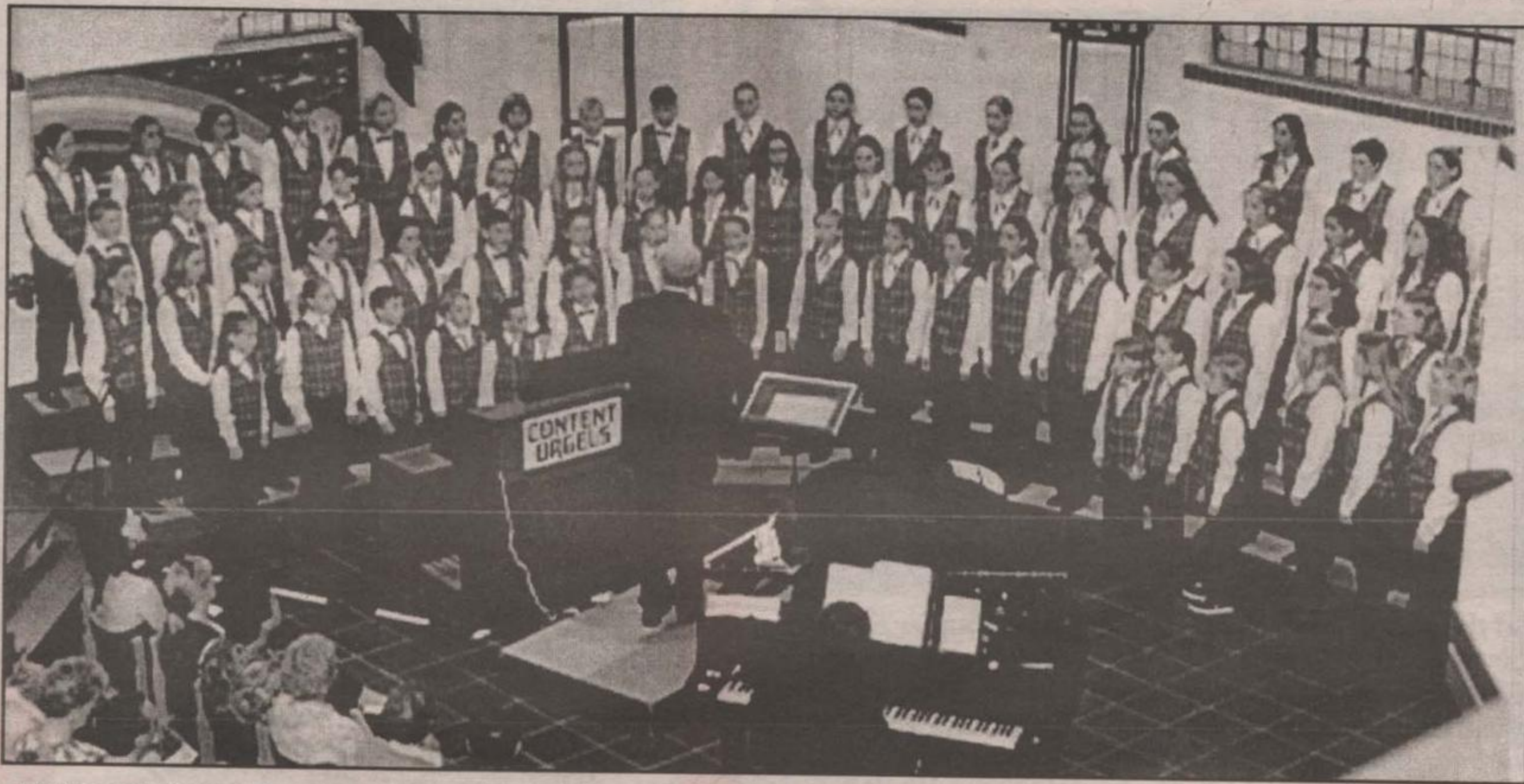
CHURCH CONCERT: Members of the Georgetown Children's Chorus performed with the United Church Male Choir in Ermelo during the trip. The Dutch choir has visited and performed in the Halton Hills area.