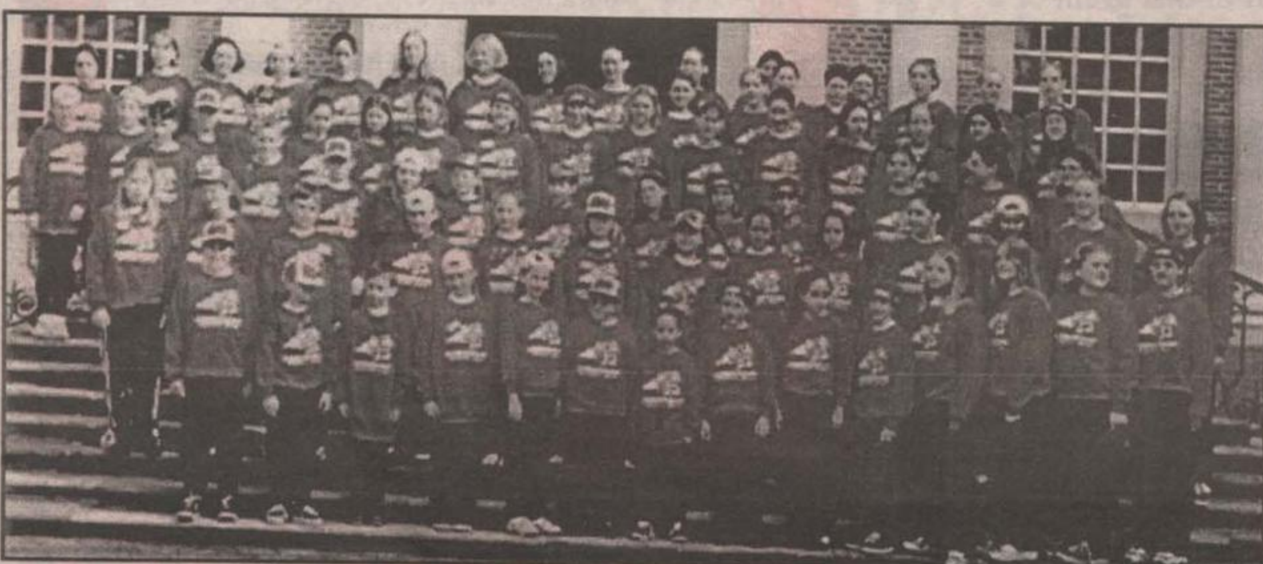
COMMAND PERFORMANCE: Chorus members gave an impromptu performance of the Dutch and Canadian national anthems for tourists on the steps of the Royal Palace at Apeldoorn.