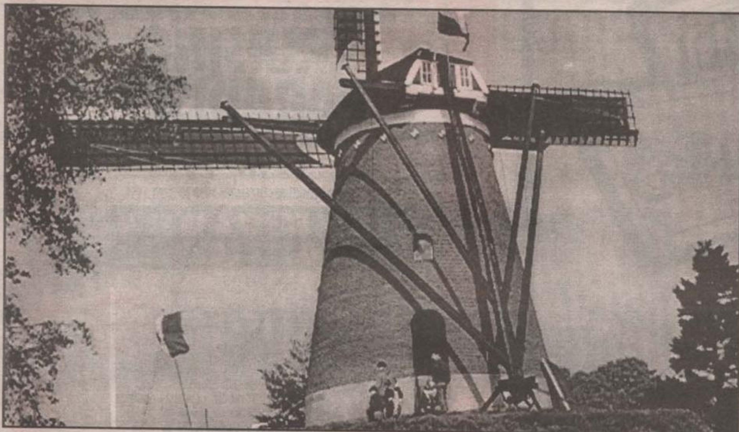
WILD WINDMILL RIDE: To help raise money for the upkeep of this traditional Dutch windmill, each year the village of Etten, 10 kilometres from the German border, stages a festival. For $25 guilders - about $20 Canadian - the very brave can be strapped onto a stretcher-type board attached to the ends of the windmill's vanes and go for a ride.