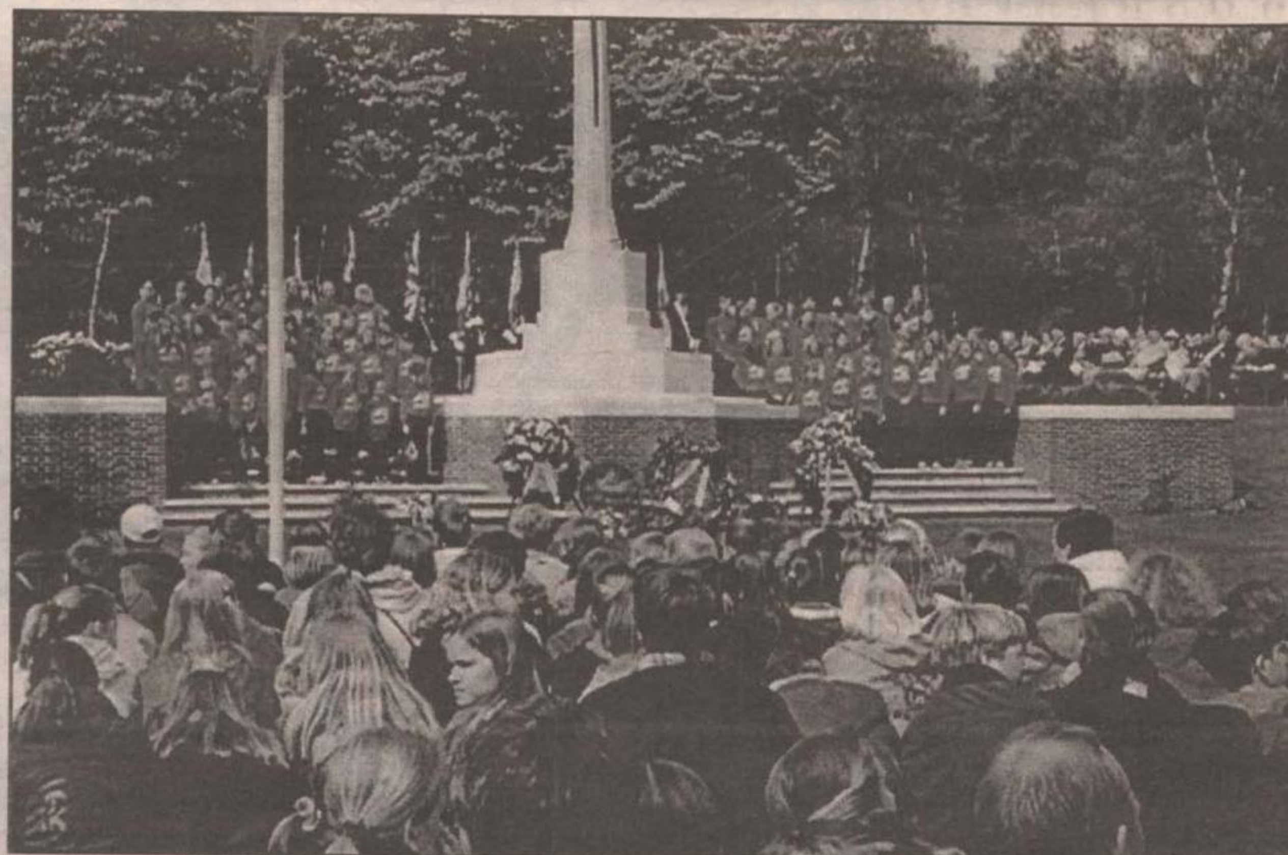
LIBERATION DAY: Dutch school children (foreground) listened as Halton Hills school children, members of the Chorus, performed during a Liberation Day Service in the Canadian War Cemetery in Houlten, Holland.