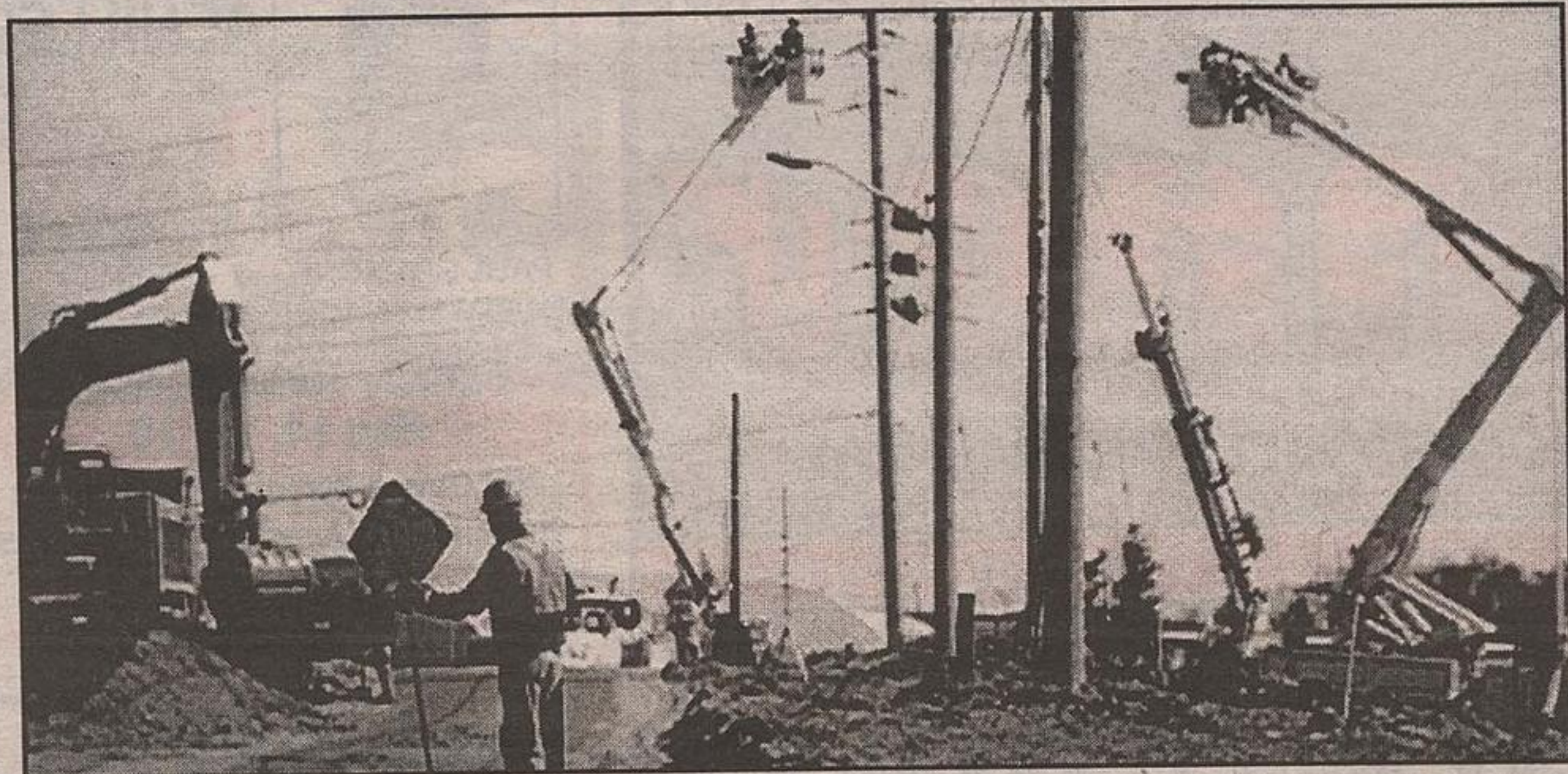
BIG KIDS AT PLAY: Construction crews are in the process of changing the playground off Danville Avenue to make room for the new extension to the West Meadow development in the North end of town.