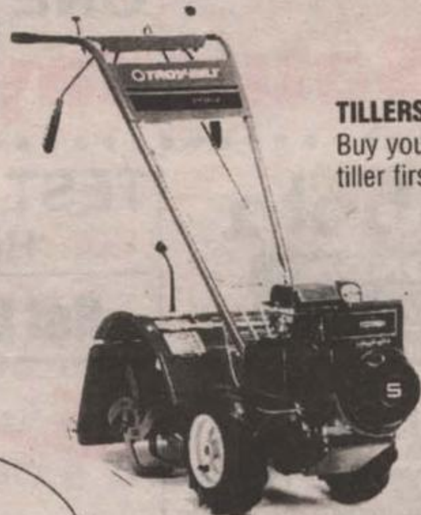
TILLERS Buy your last tiller first