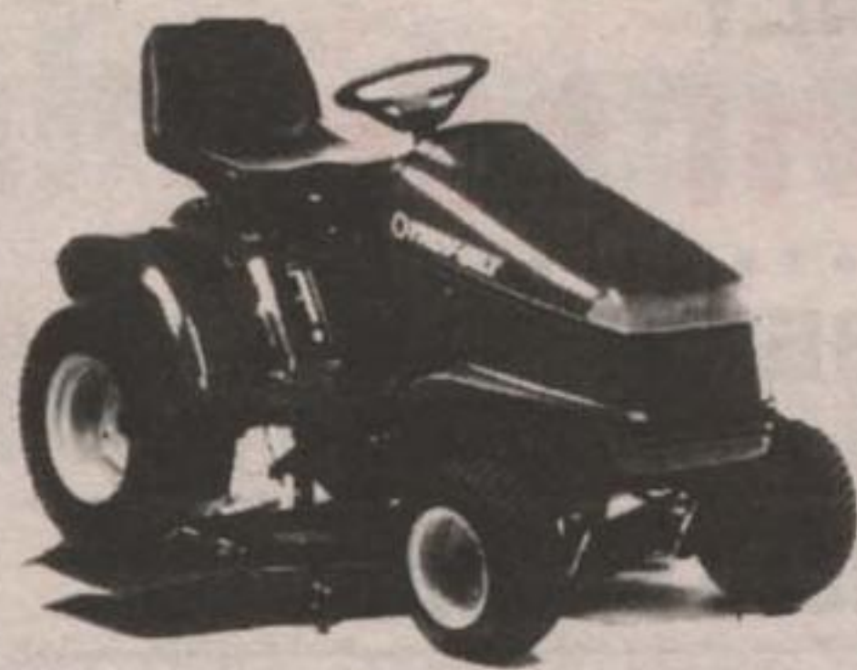
LAWN AND GARDEN TRACTORS Best in performance and quality