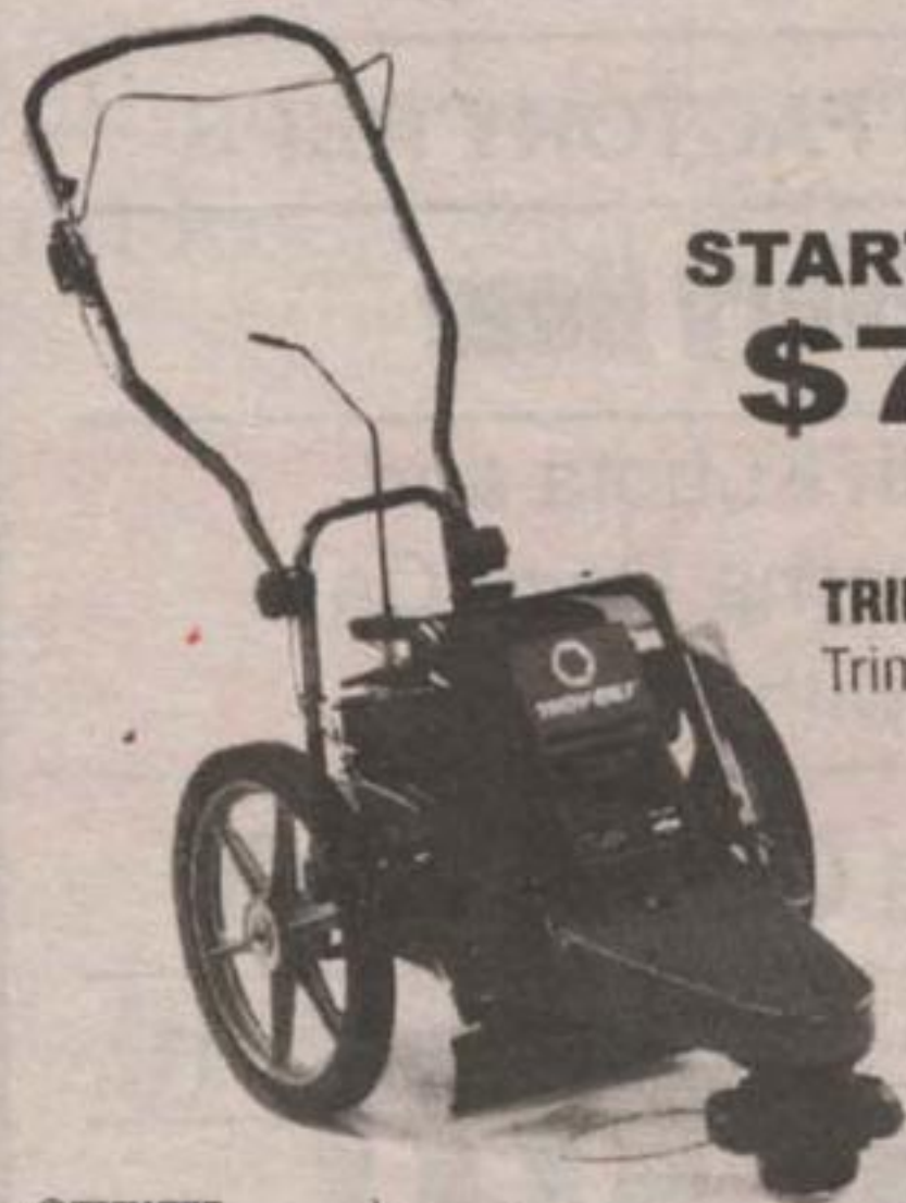
TRIMMER/MOWERS Trim, mow and clear