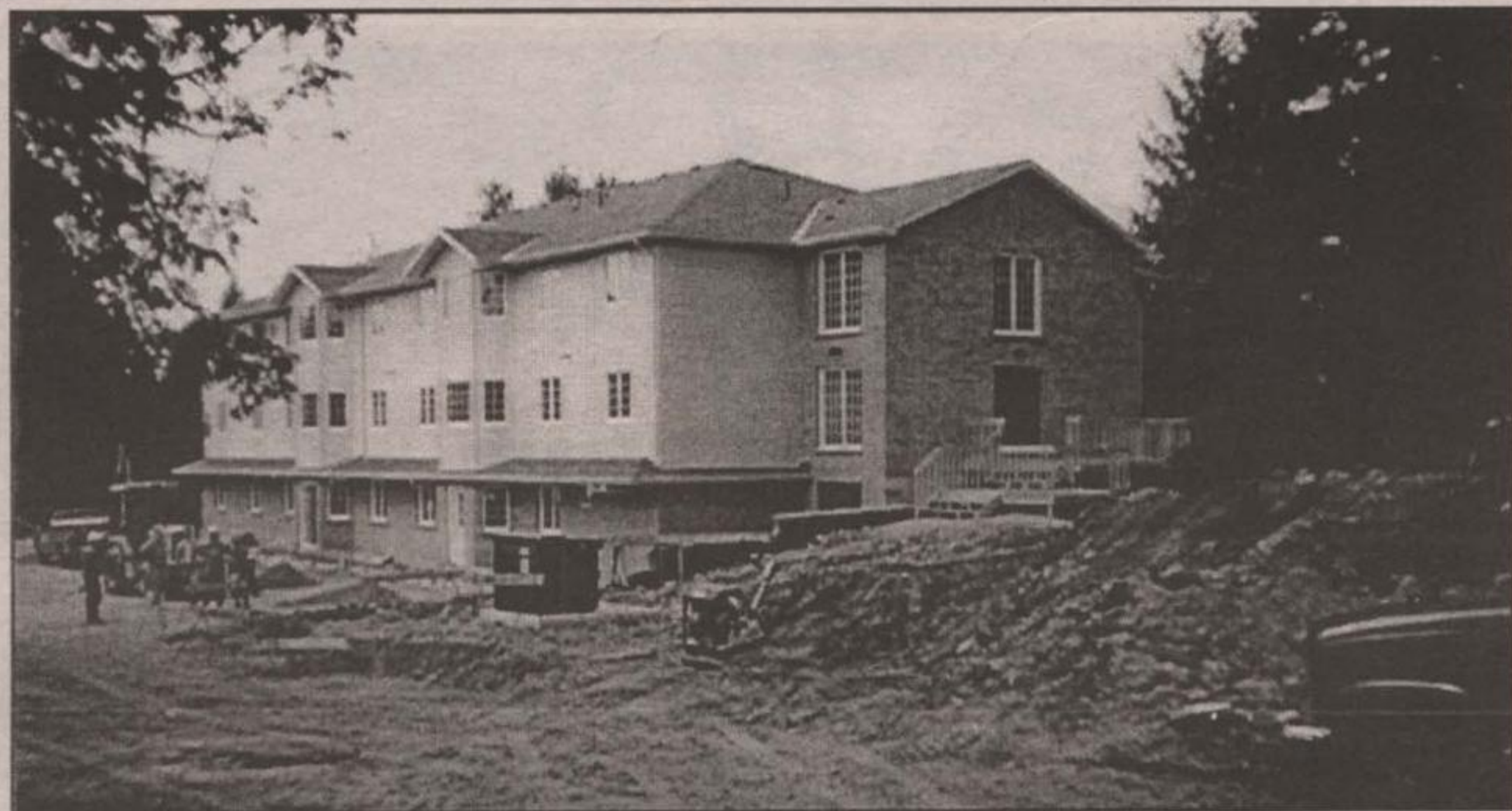
FOR RENT: Cedar Cliff Place developers have many of their two-bedroom units ready for occupancy although workmen are still finishing off landscaping.

Burglar Alarms • CCTV • Door Access Home Automation