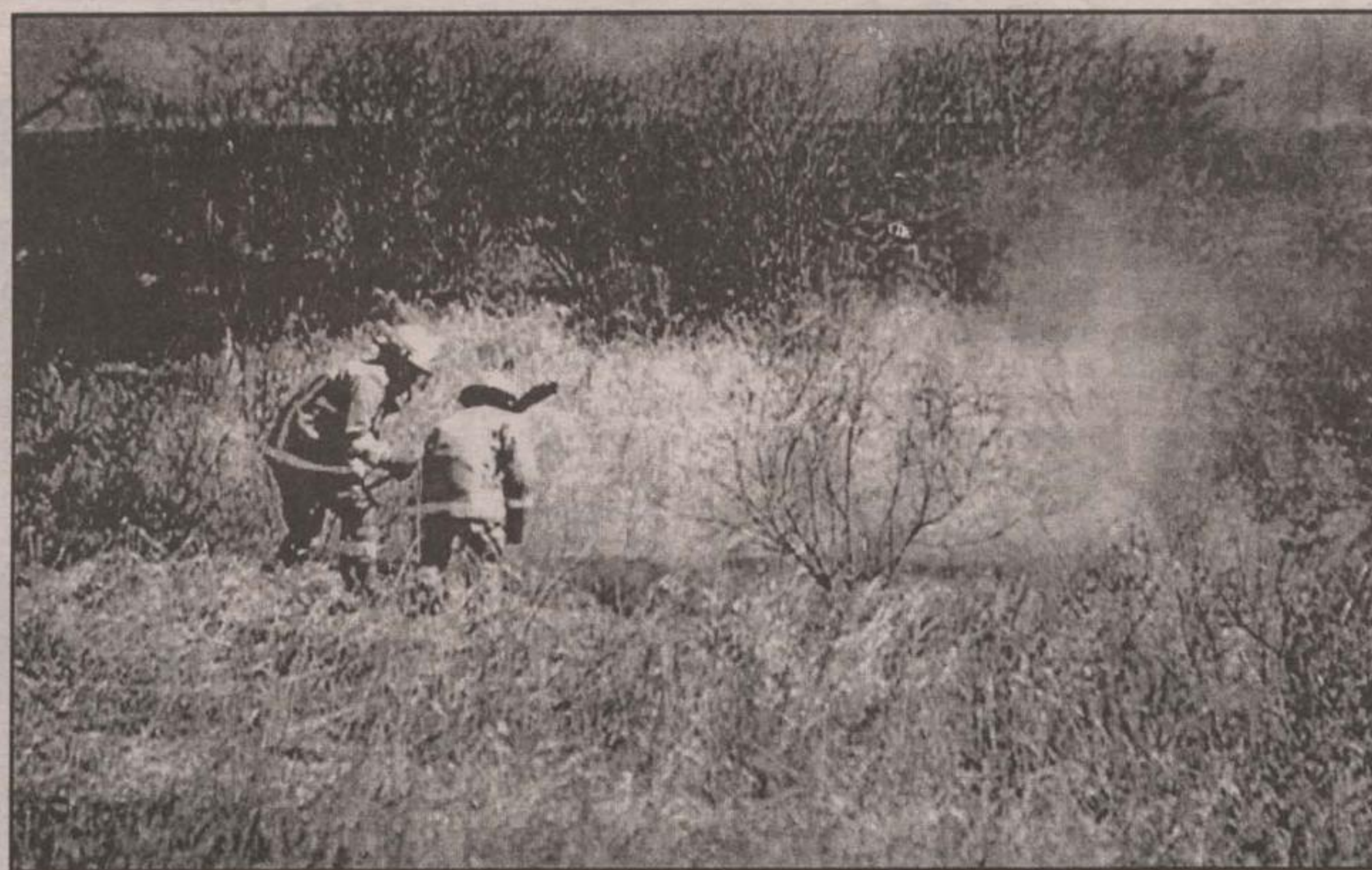
MEN AT WORK: Acton Firefighters were hard at work on Monday at a grass fire on the 4th line of Nassagewya, south of the Eden Mills Road.