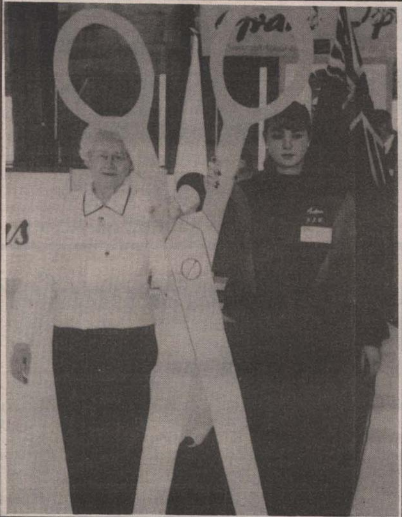
Bringing in the shears for the grand opening parade Sunday as Acton Citizens' Band played the Olympic Anthem.