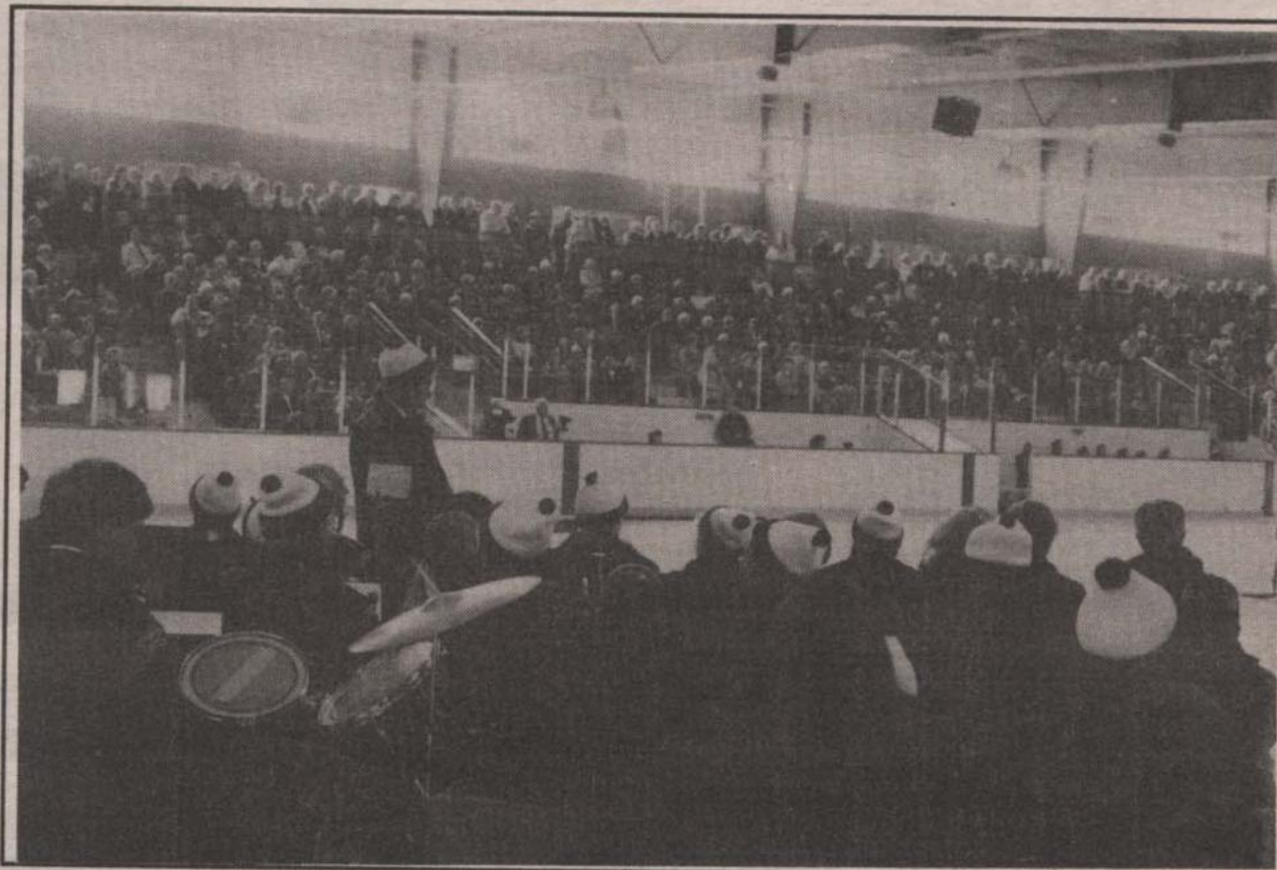
Acton Citizens' Band, as usual, contributed much to the solemnity and enjoyment of the official opening.