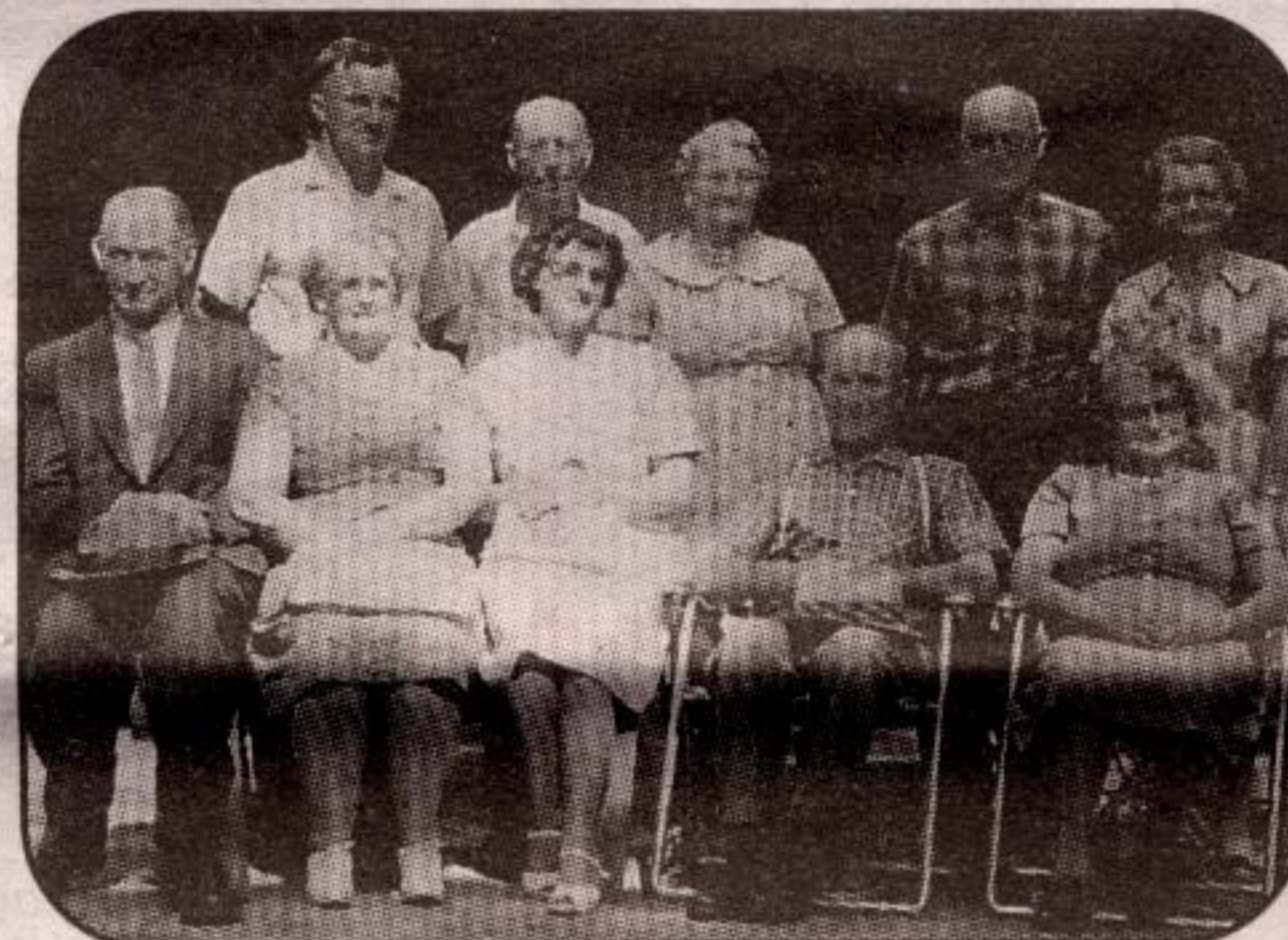
1963 Michigan Reunion