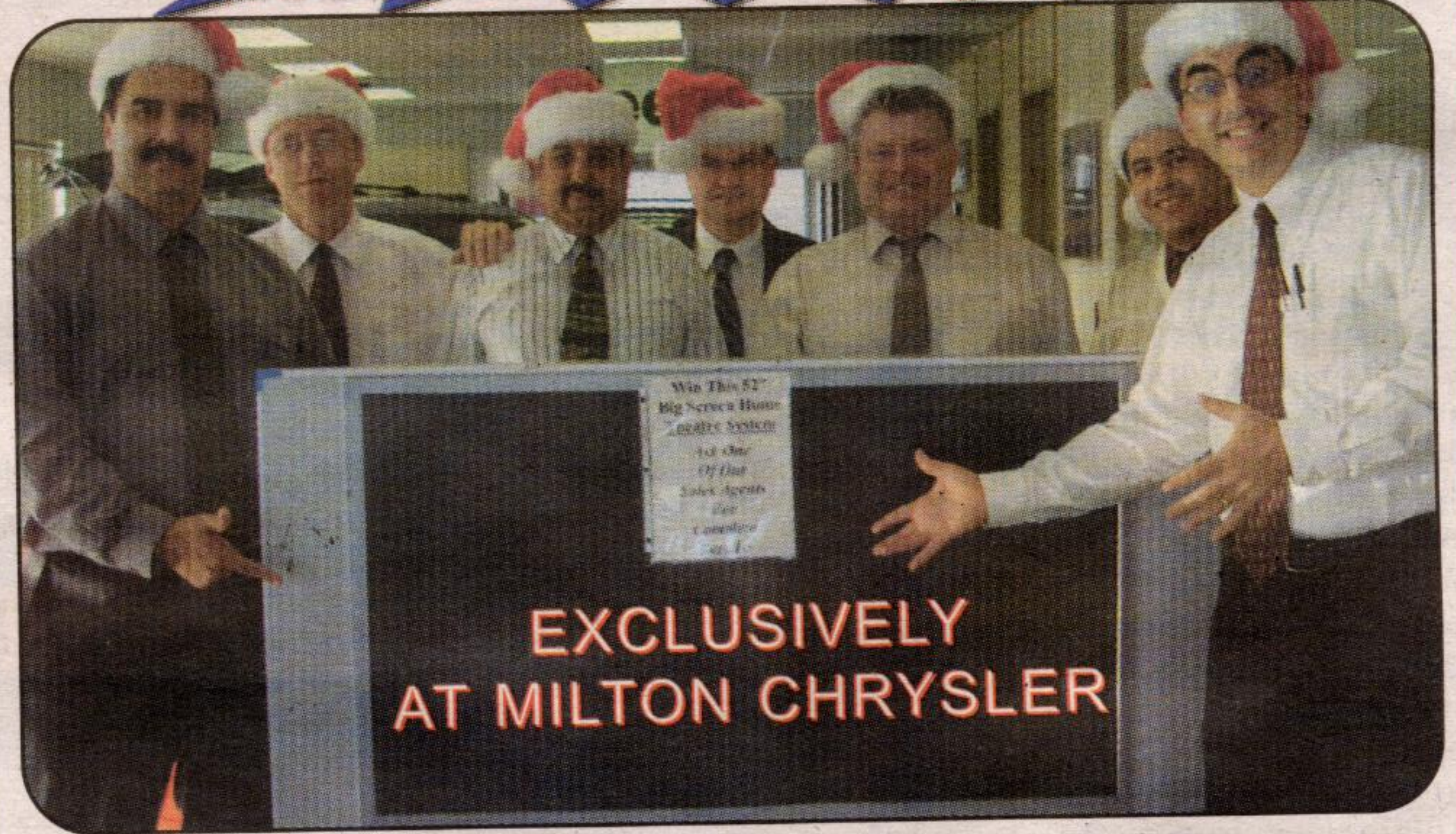
Includes 52" Toshiba HD DLP Big Screen TV & Surround Sound System with DVD/VCR, receiver & subwoofer speaker package with matching stand. Visit us for more deals.††

WIN 52" High Definition DLP Home Theatre System