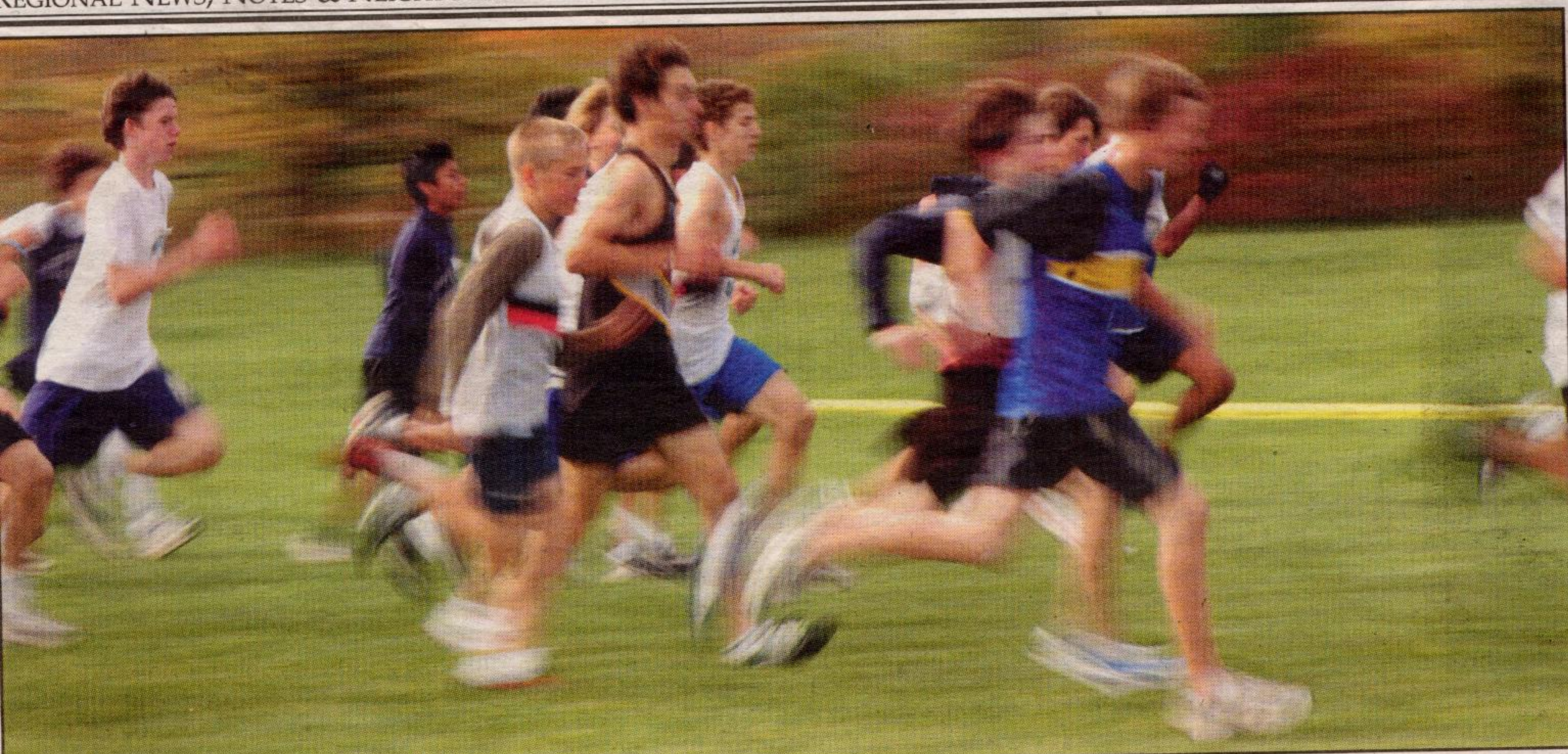
Midget boys start at the Halton/GHAC cross country championships at Bronte Creek Provincial Park..