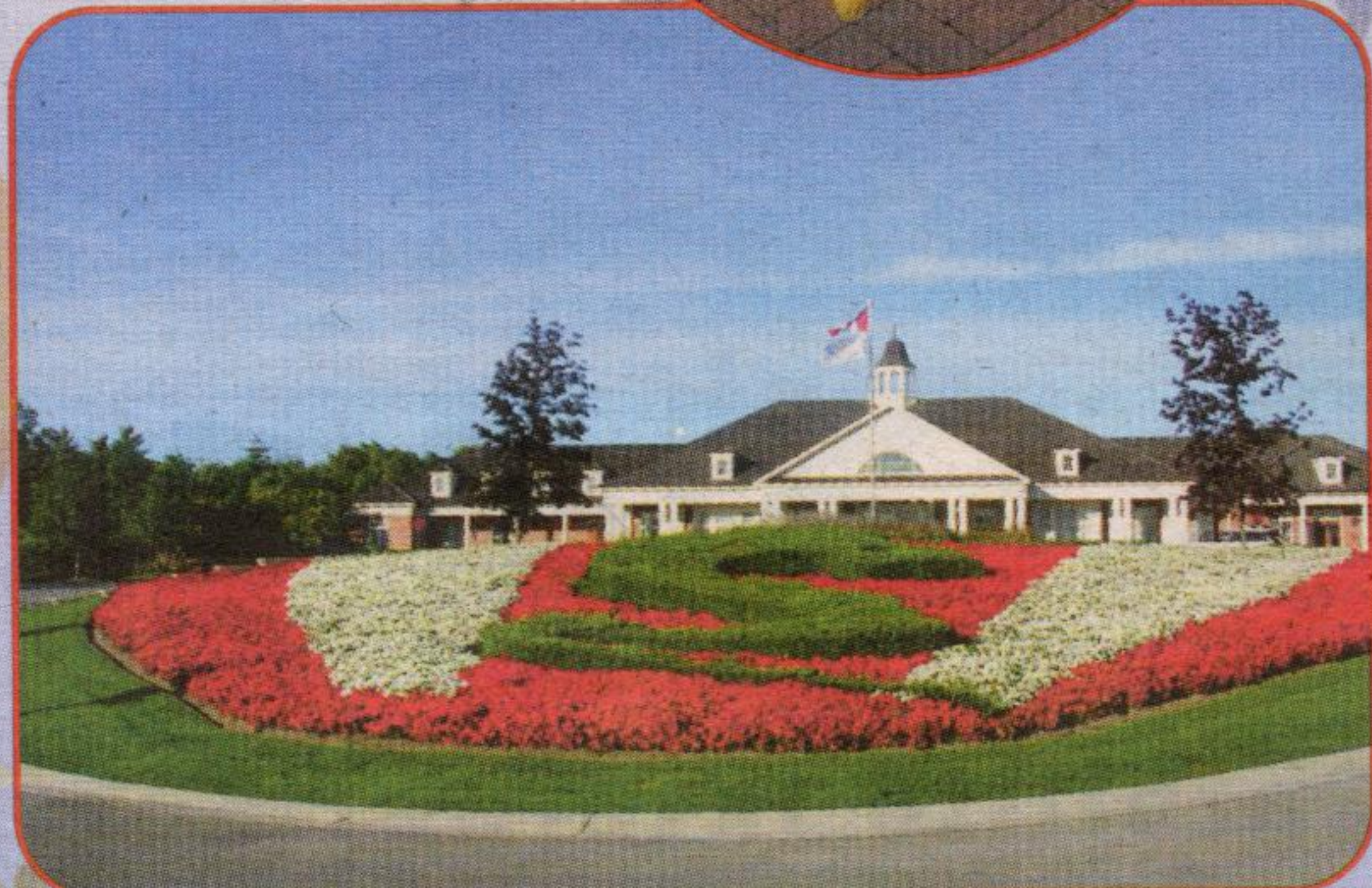
Rattlesnake Point Golf and Country Club was the venue.