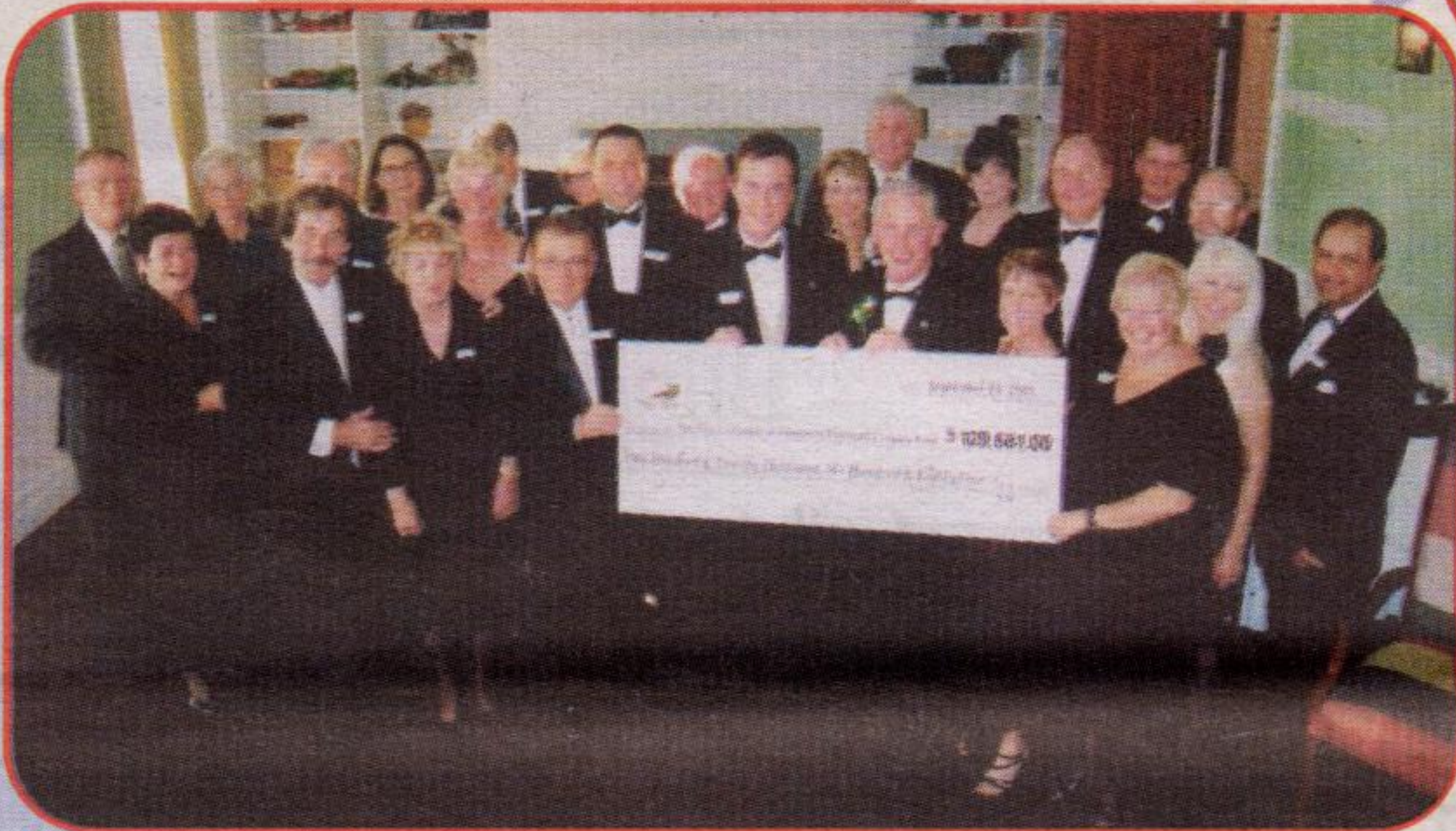
Above: Pictured here is Mayor Krantz receiving a cheque for $120,681 from the major sponsors of the dinner.