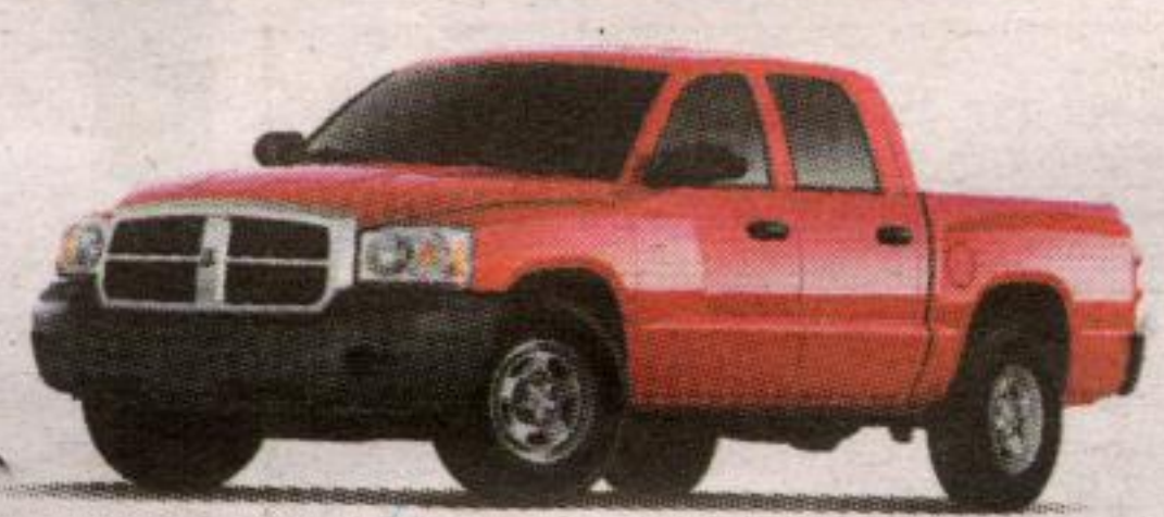
2005 DODGE DAKOTA