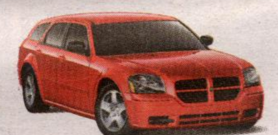
2005 DODGE MAGNUM