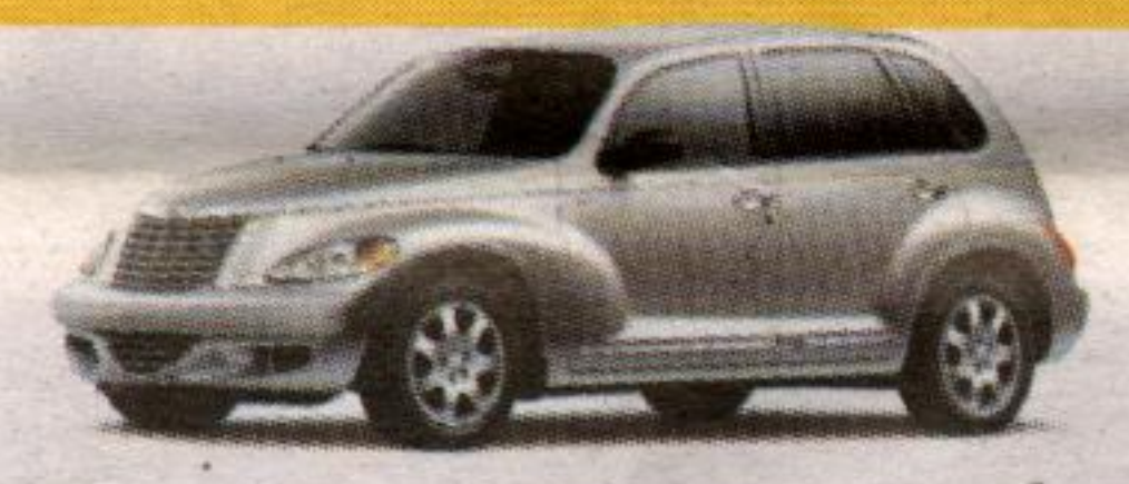
2005 CHRYSLER PT CRUISER