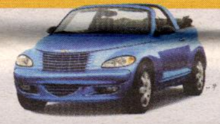
2005 CHRYSLER PT CRUISER