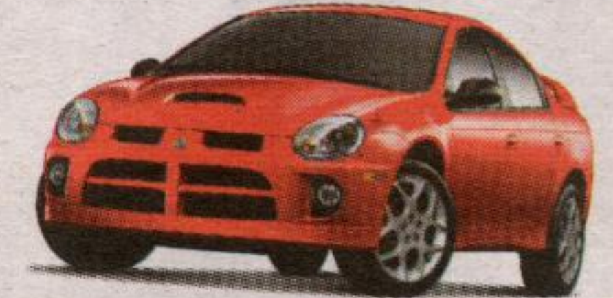
2005 DODGE SX 2.0