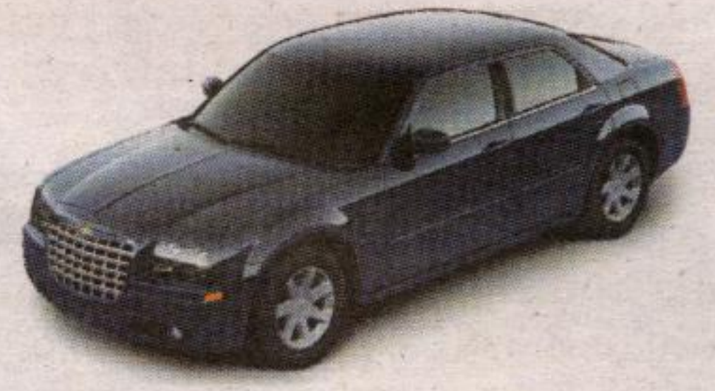
2005 CHRYSLER 300M