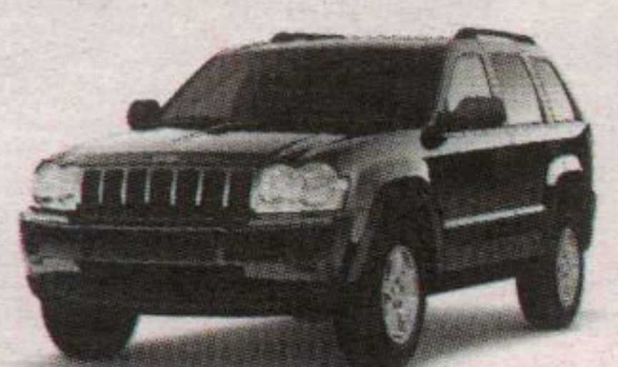
2005 JEEP GRAND CHEROKEE