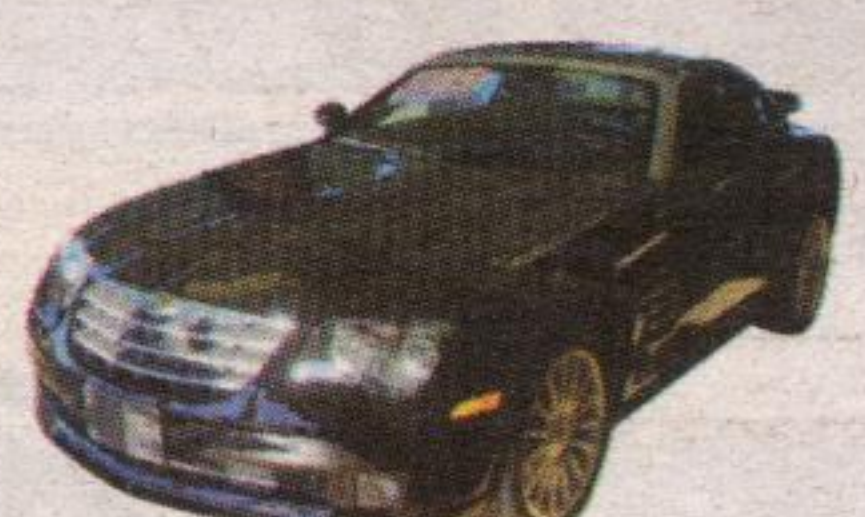
2005 CHRYSLER CROSSFIRE SRT6