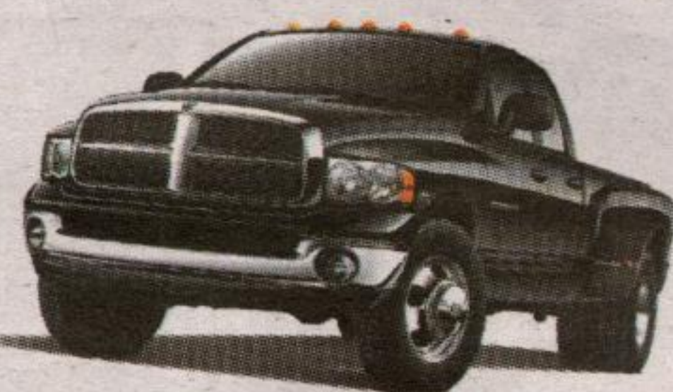
2005 DODGE RAM