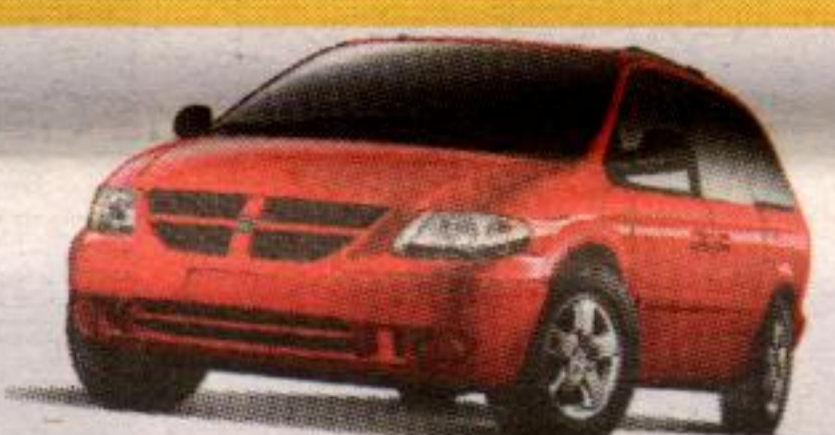
2005 DODGE GRAND CARAVAN