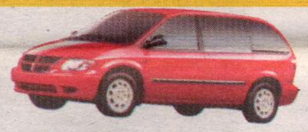
2005 DODGE CARAVAN

WE ARE MAKING OUR BEST POSSIBLE DEALS ON ALL OF OUR REMAINING IN-STOCK 2005 MODELS