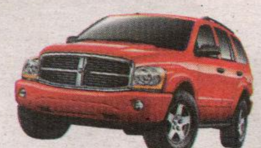
2005 DODGE DURANGO