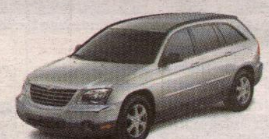
2005 CHRYSLER PACIFICA