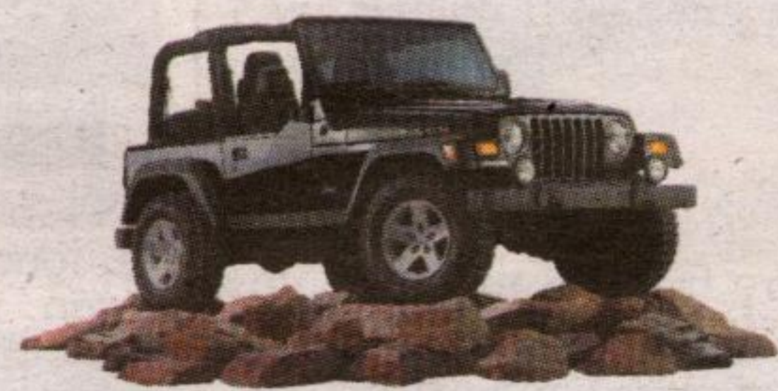
2005 JEEP TJ