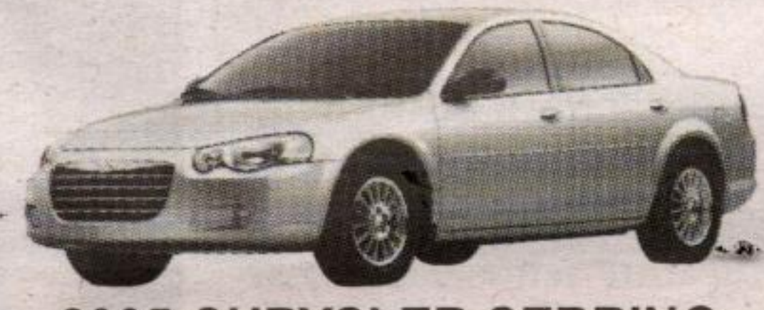
2005 CHRYSLER SEBRING