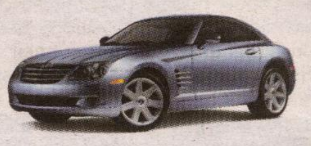
2005 CHRYSLER CROSSFIRE