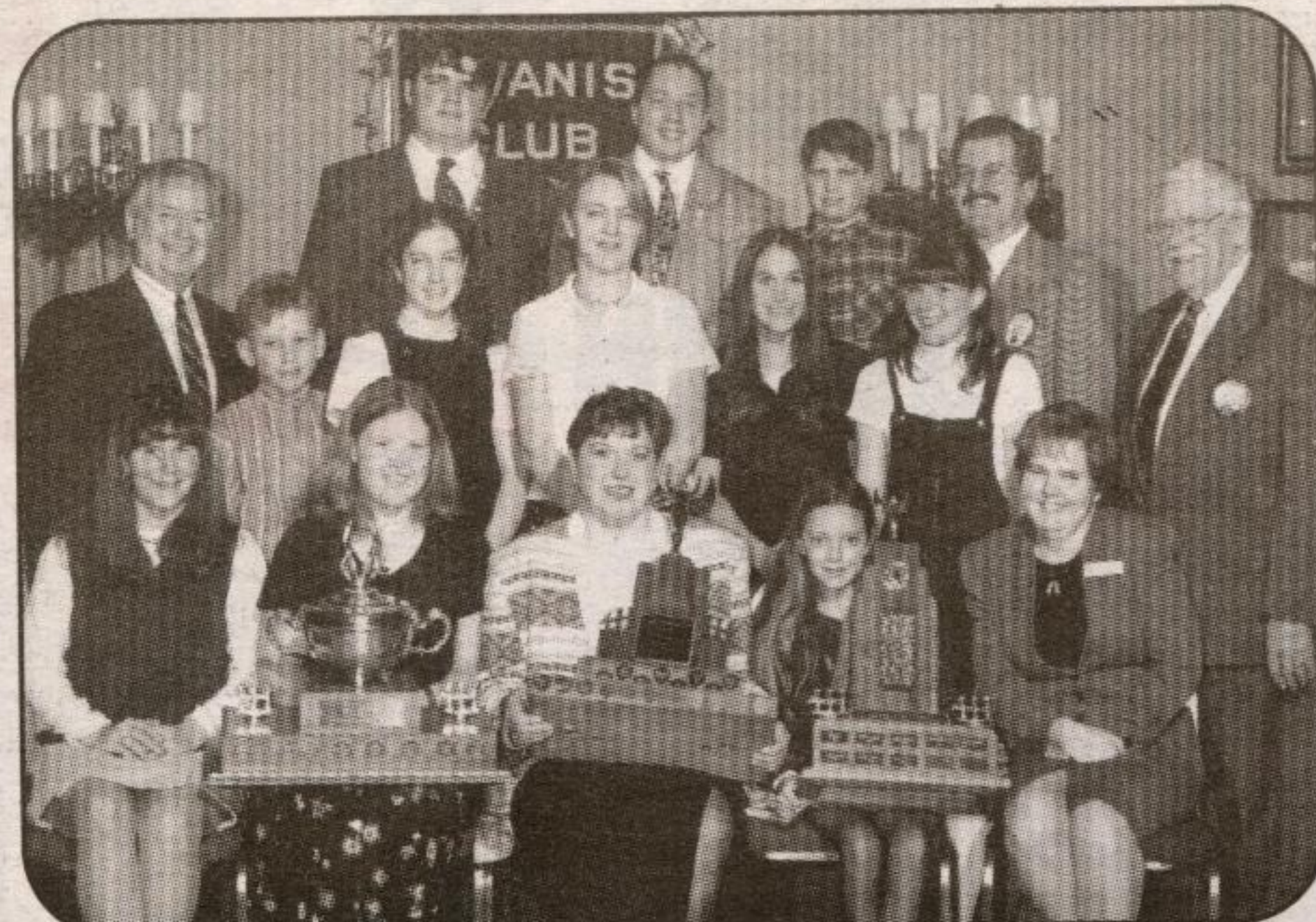
Award Winners 1997 Kiwanis Club