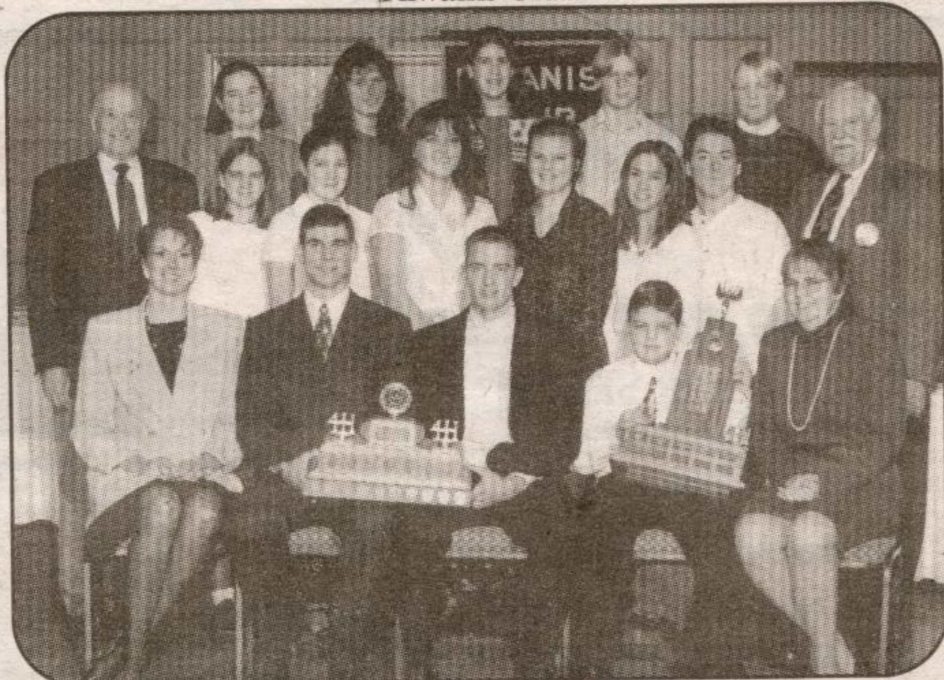
Award Winners 1996 Kiwanis Club