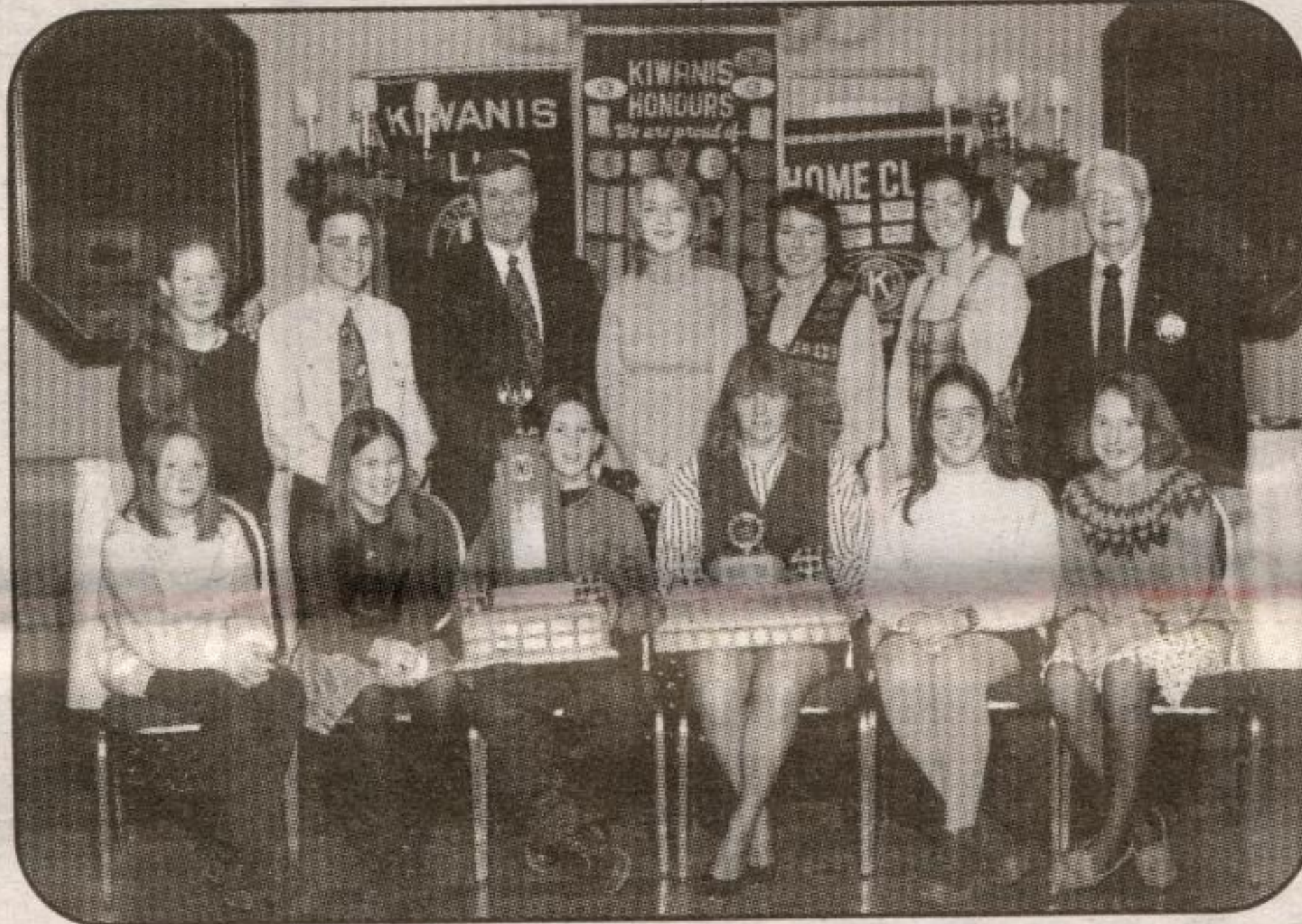
Award Winners 1995 Kiwanis Club