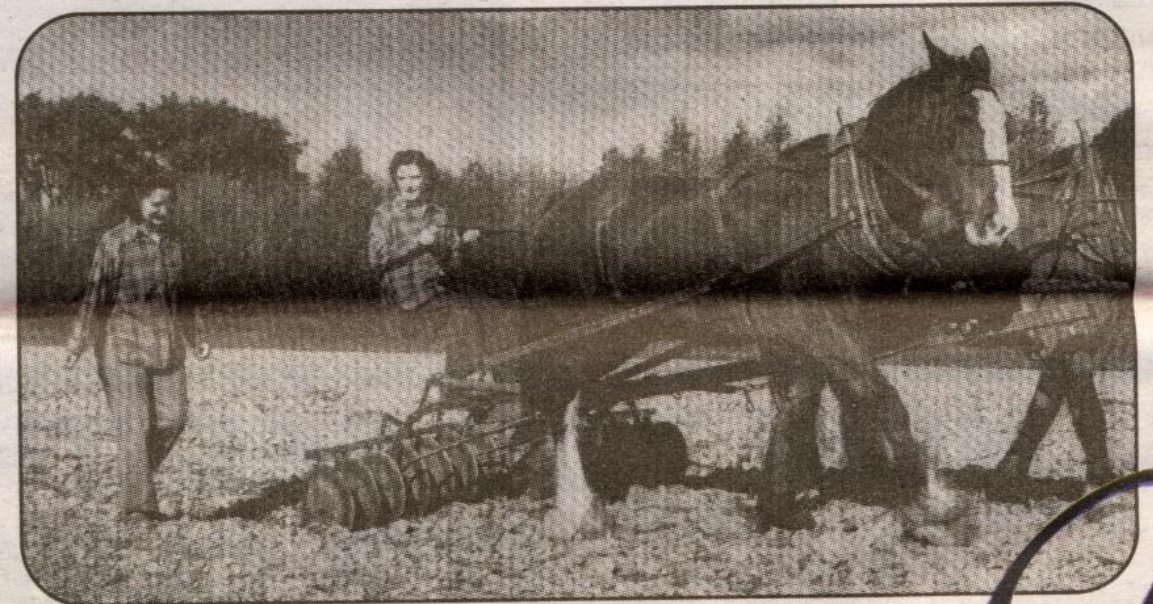
All in the Days Work

I Pledge, My Head to clearer thinking, My Heart to greater loyalty, My Hands to larger service, My Health to better living, For my club, my community and my country.