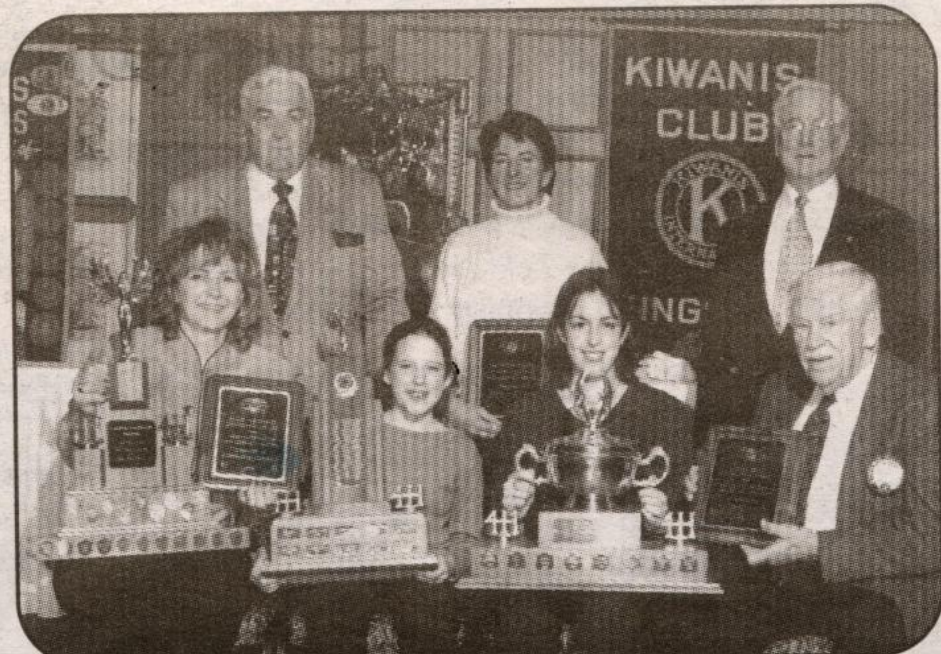
Award Winners 1998 Kiwanis Club