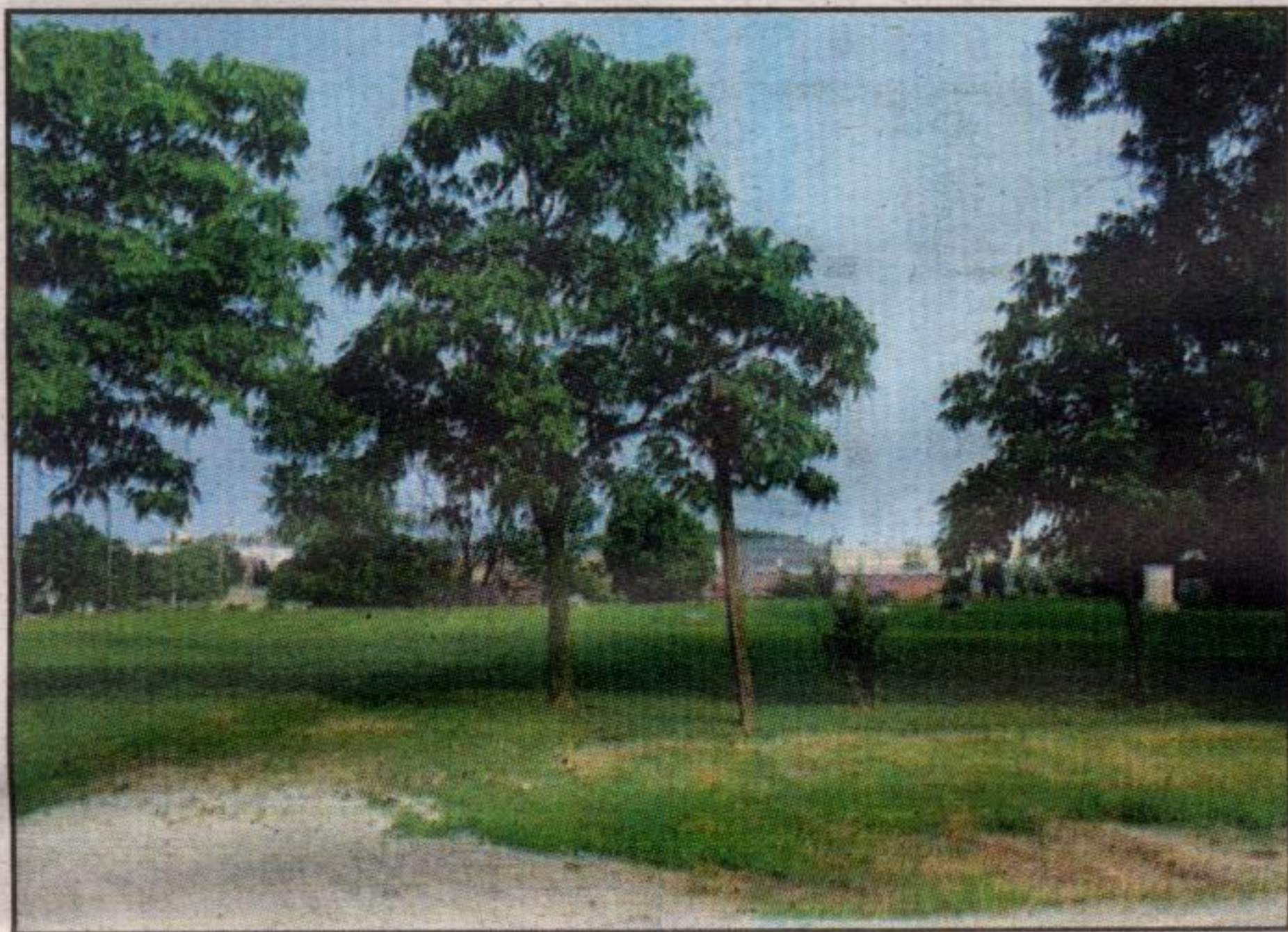
Merton Pioneer Cemetery

The scanning will take place at Oakville Town Hall at 1225 Trafalgar Road in the atrium. To volunteer with driving or for more information, contact Michelle Knoll at 905-257-9080. For more information about Trafalgar 200, go to www.trafalgar200.ca .