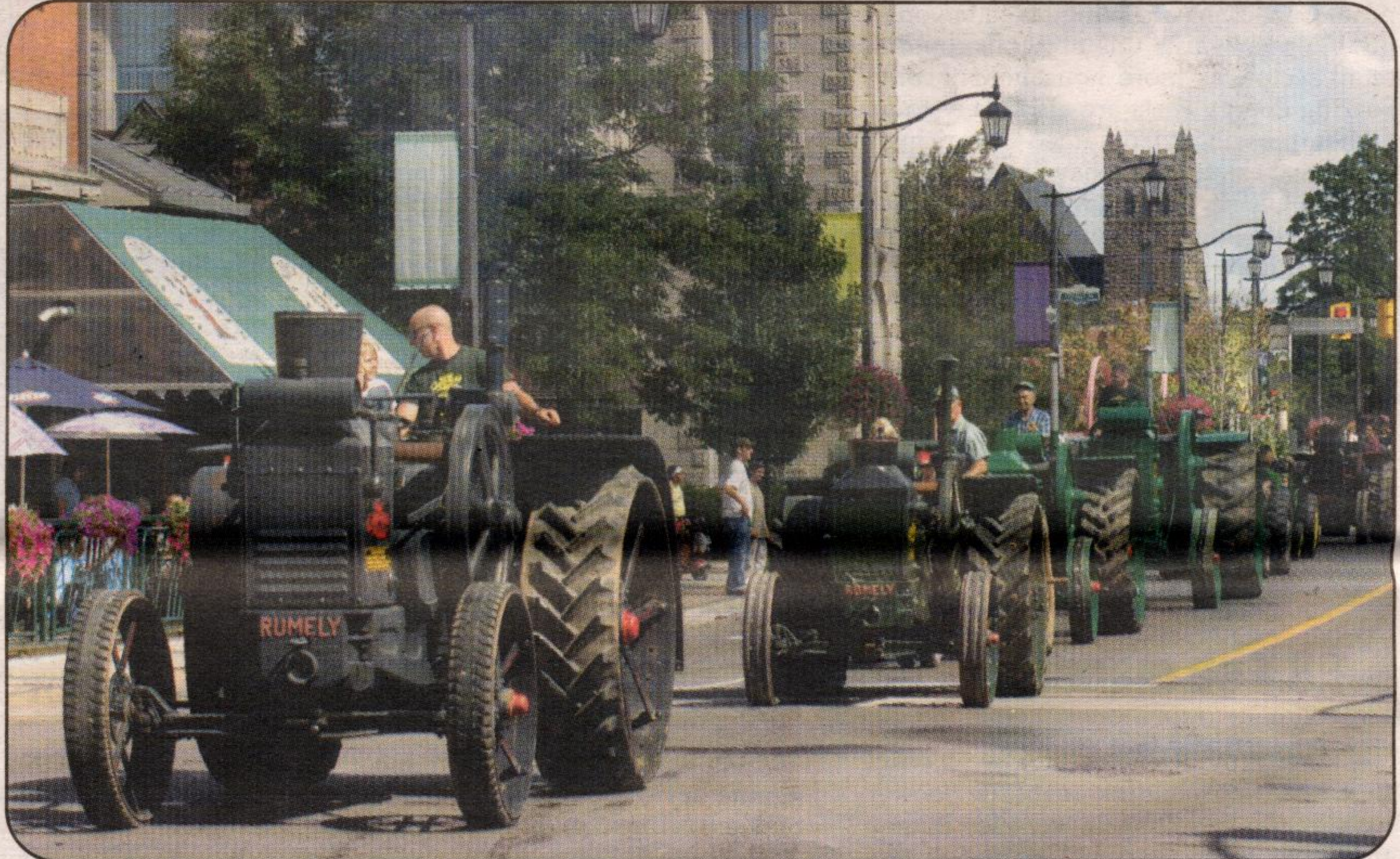
Rumley Oil tractors rumble through Milton Streets.