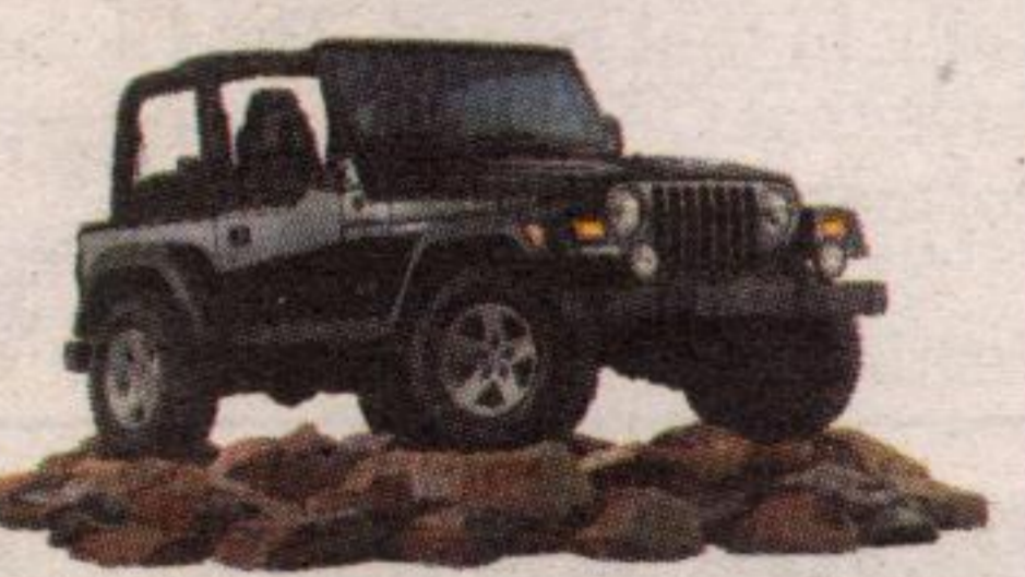
2005 Jeep TJ