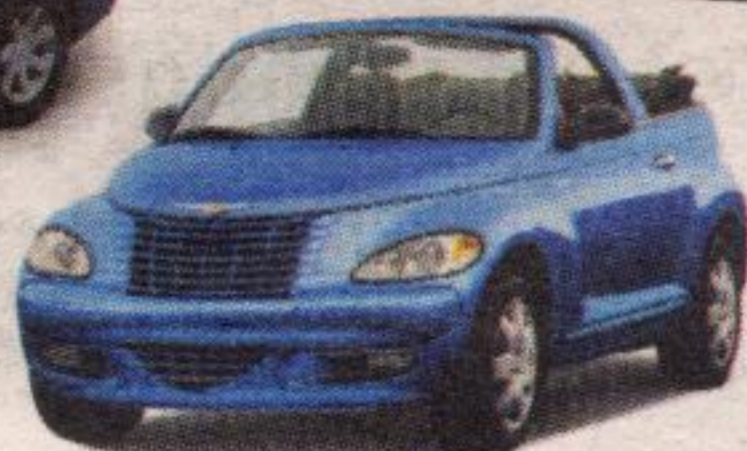
2005 PT Cruiser Convertible