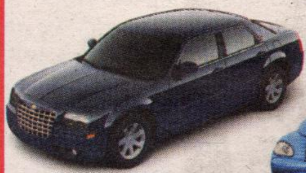
2005 Chrysler 300

CASH PRICE $19,488 * 48 MONTHS GOLD KEY LEASE / $0 DOWN $299 † per mth