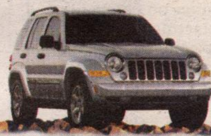
2005 Jeep Liberty