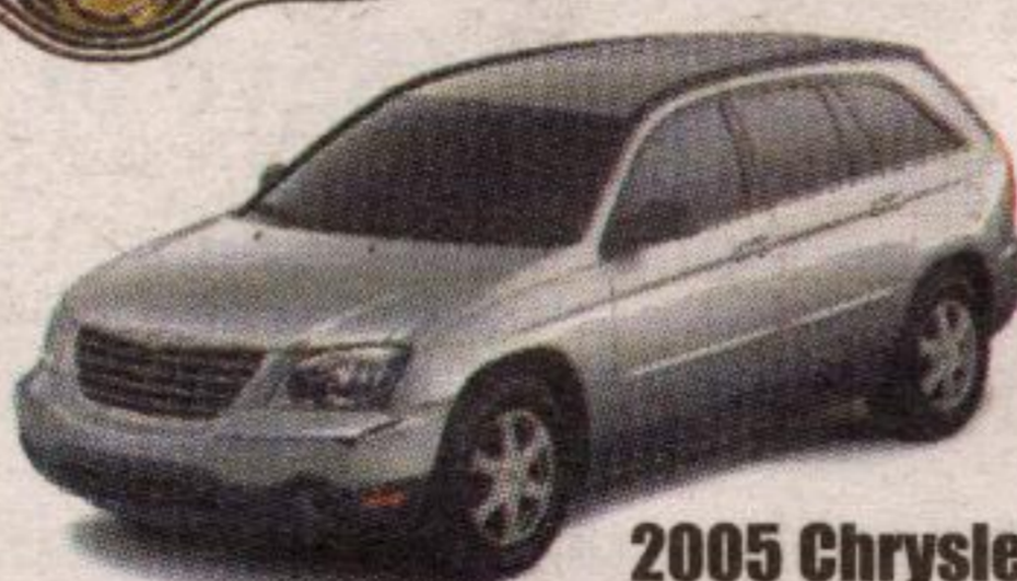
2005 Chrysler Pacifica