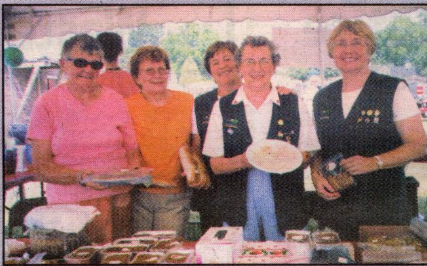
The smiling faces of the Auxiliary volunteers at the Strawberry Fair Bake Table

Take a break from the Milton Fall Fair, and rest awhile over a cup of tea and a piece of home-baked pie or delicious sandwich. This year's Tea Room, operated and staffed by the Auxiliary volunteers. It will be held September 23rd, 24th and 25th at the Milton Fairgrounds. Remembers ALL proceeds from the Tea Room will help the Milton District Hospital.