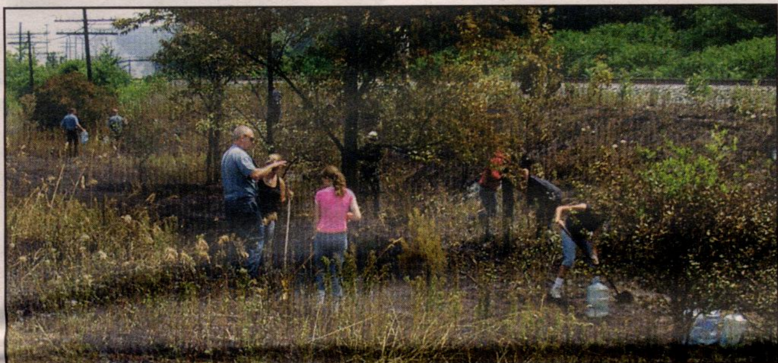
"Men with Brooms"