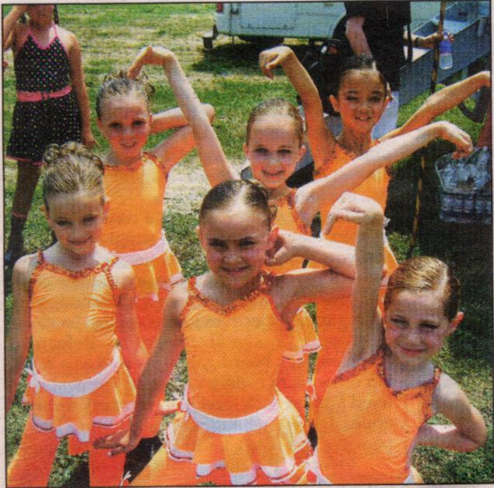
Above: Performing in bright orange costumes are the little dancers of the Georgetown Dance Company.