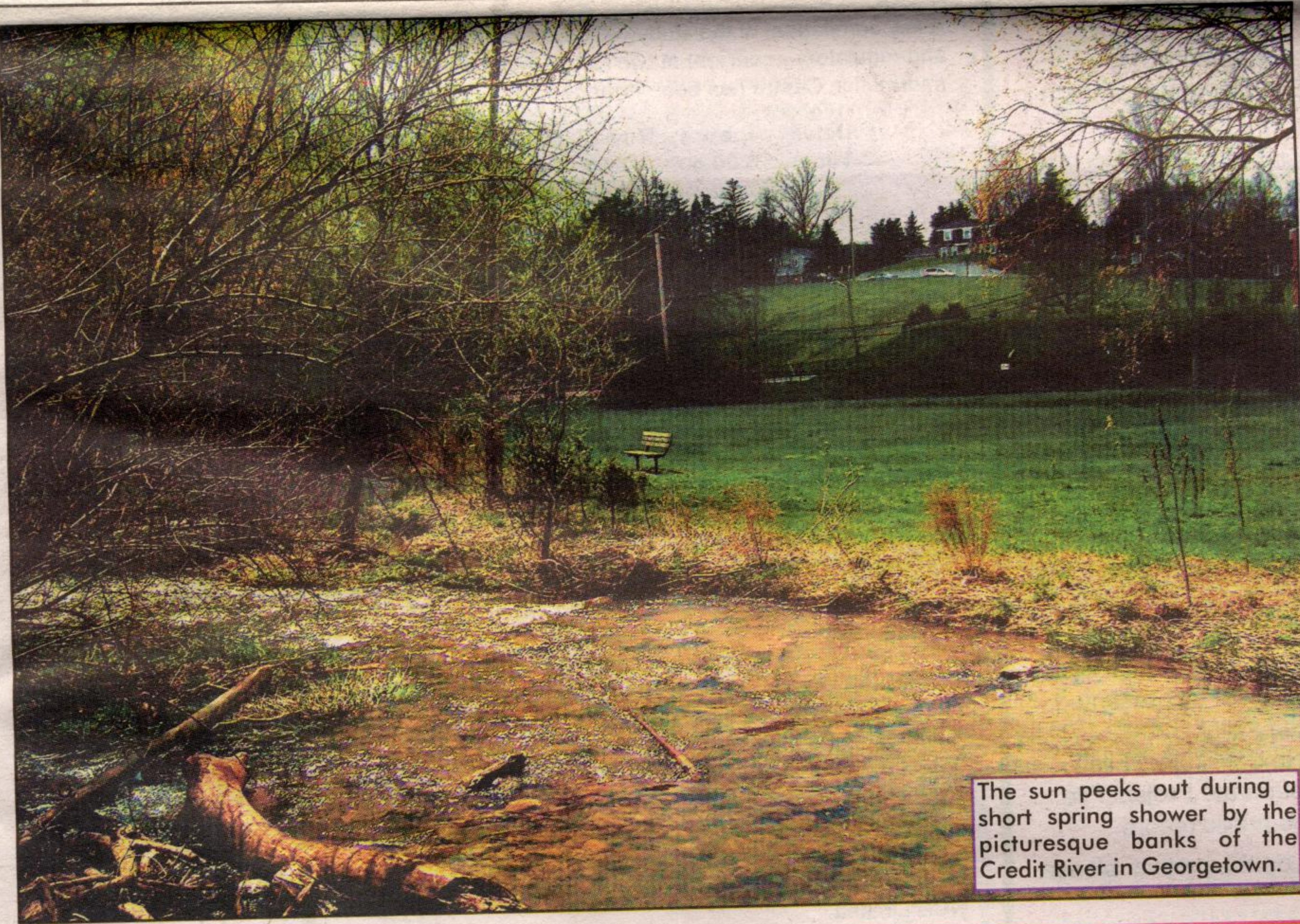
The sun peeks out during a short spring shower by the picturesque banks of the Credit River in Georgetown.