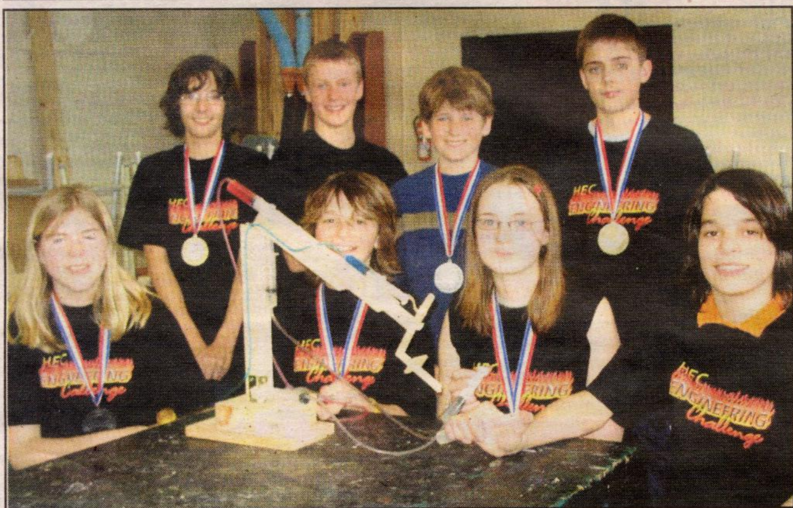
Brookville students win engineering awards