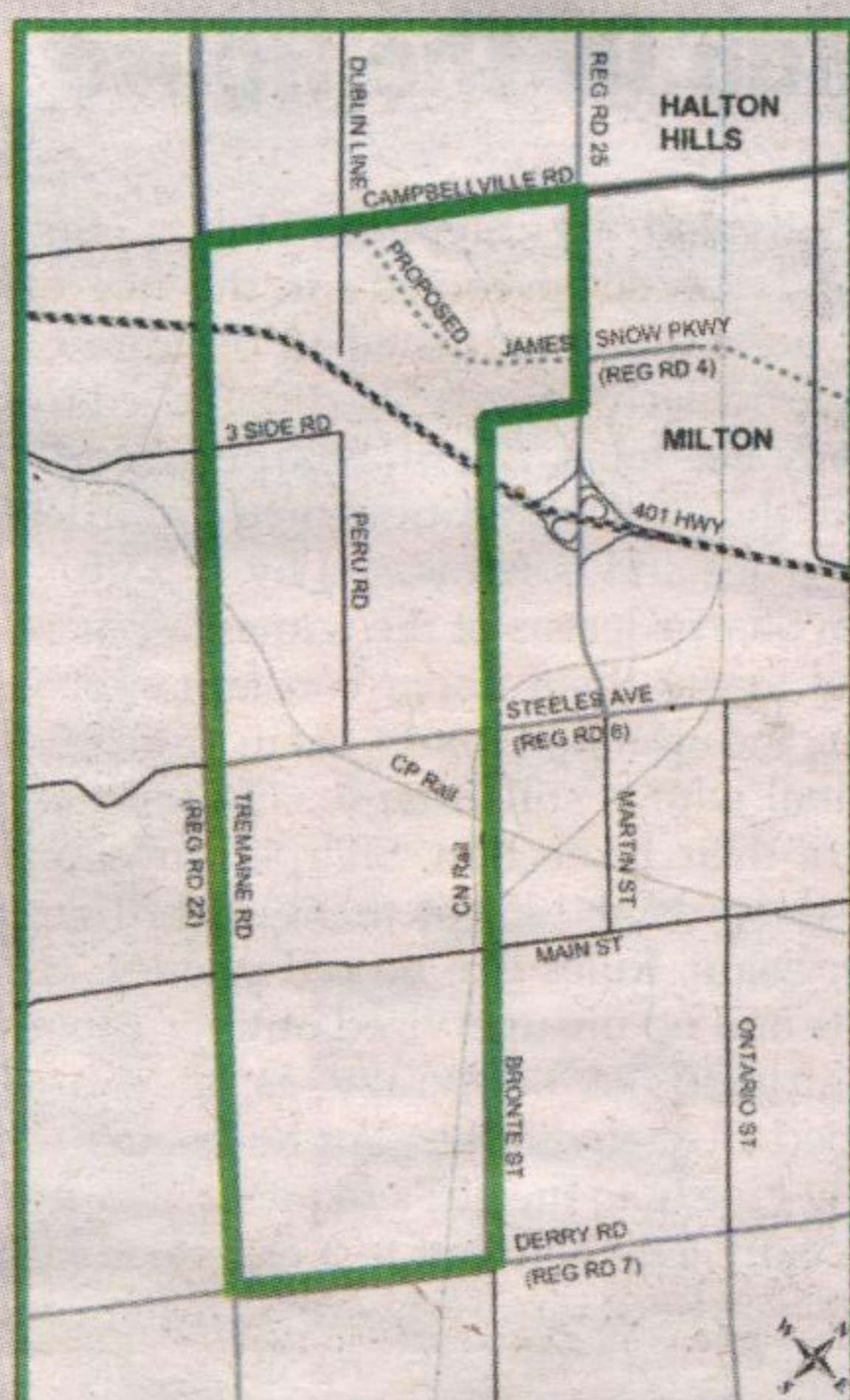
The map below shows the approximate limits of the study area.

A key component of the study will be consultation with interested stakeholders (public and regulatory agencies) at two Public Information Centres (PICs). The PICs will provide stakeholders with an opportunity to meet the Project Team, review the study scope and discuss issues related to the project including alternative solutions, environmental considerations, evaluation criteria and alternative designs. It is anticipated that the first public meeting will be held in June, 2005. Details regarding the forthcoming PICs will be advertised as the study progresses.