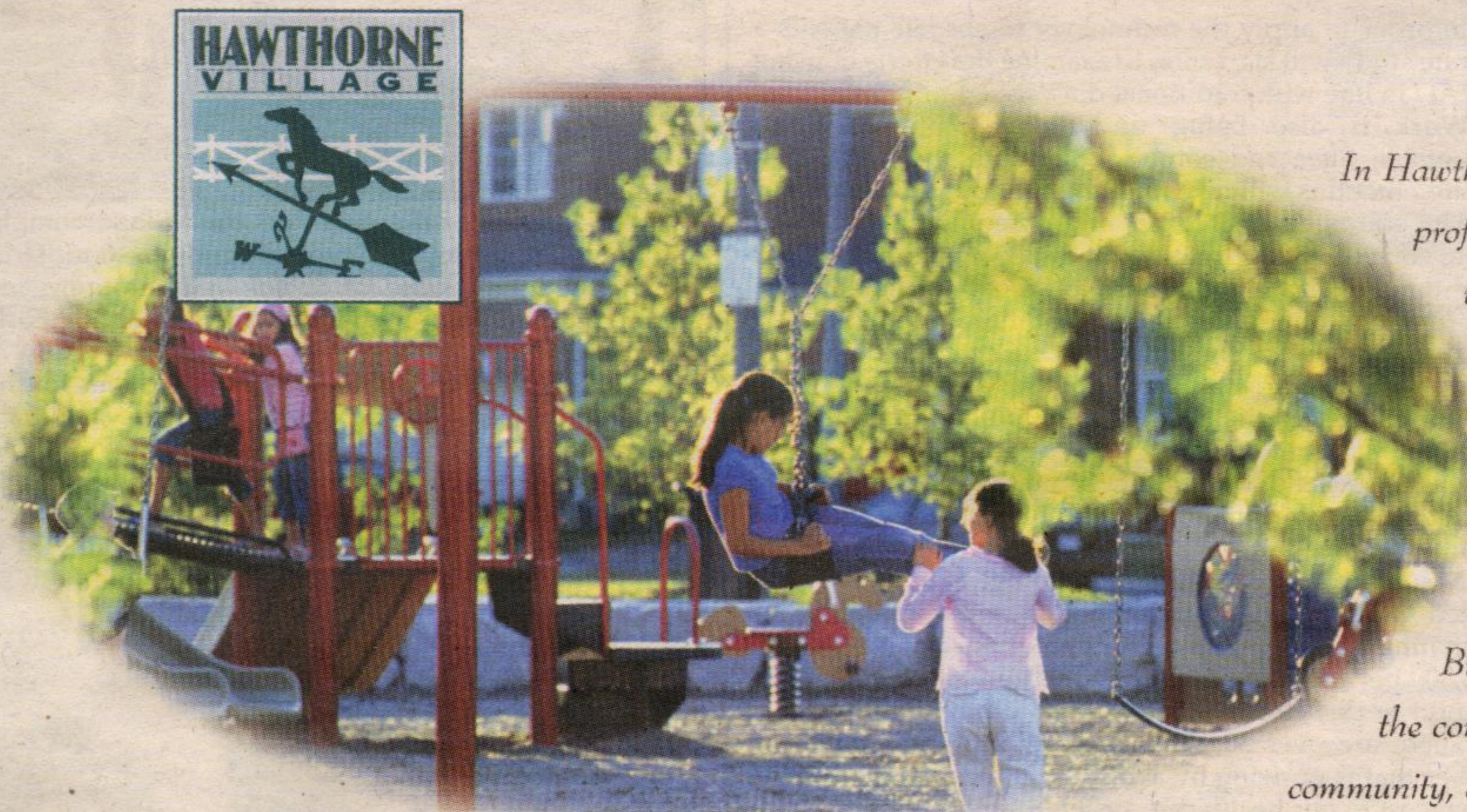
Hawthorne Village Parkette

In Hawthorne Village, the homes present a wide profile to the street and most offer front porches, which is a great family gathering place. Neighbours greet each other warmly and some stop out front for a while just to chat. Street traffic is lighter because there are fewer homes and the streets wind gently which encourages cars to drive slowly. Parkettes dot the community and serve as places where kids play. Biking and walking paths are also scattered throughout the community. Come and visit Canada's largest WideLot™ community, and see why it's a place called home by more than 3,000 families.