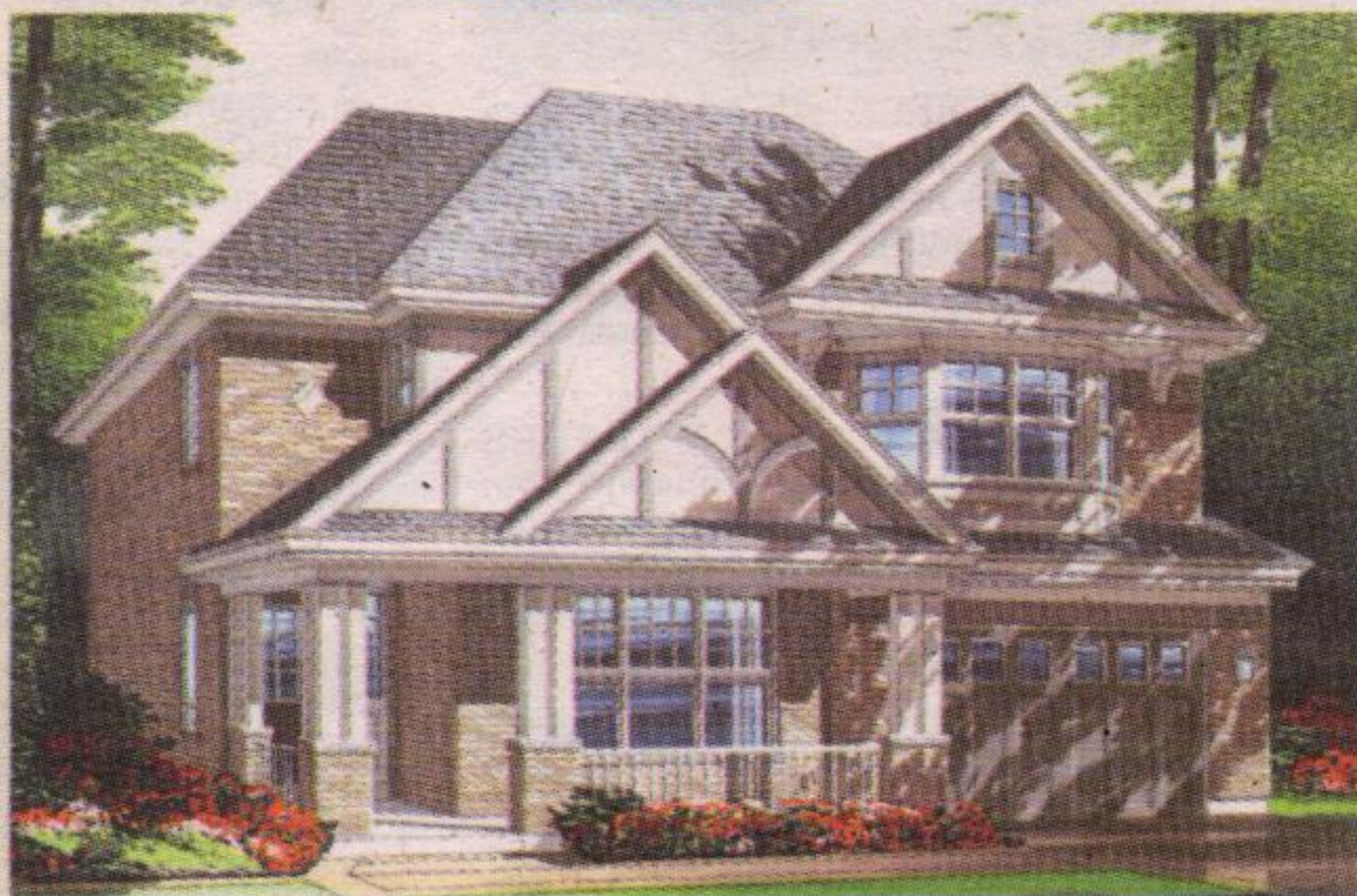
36' WideLot™, The Nettlebrook 'D', 1,738 Sq.Ft. $292,990