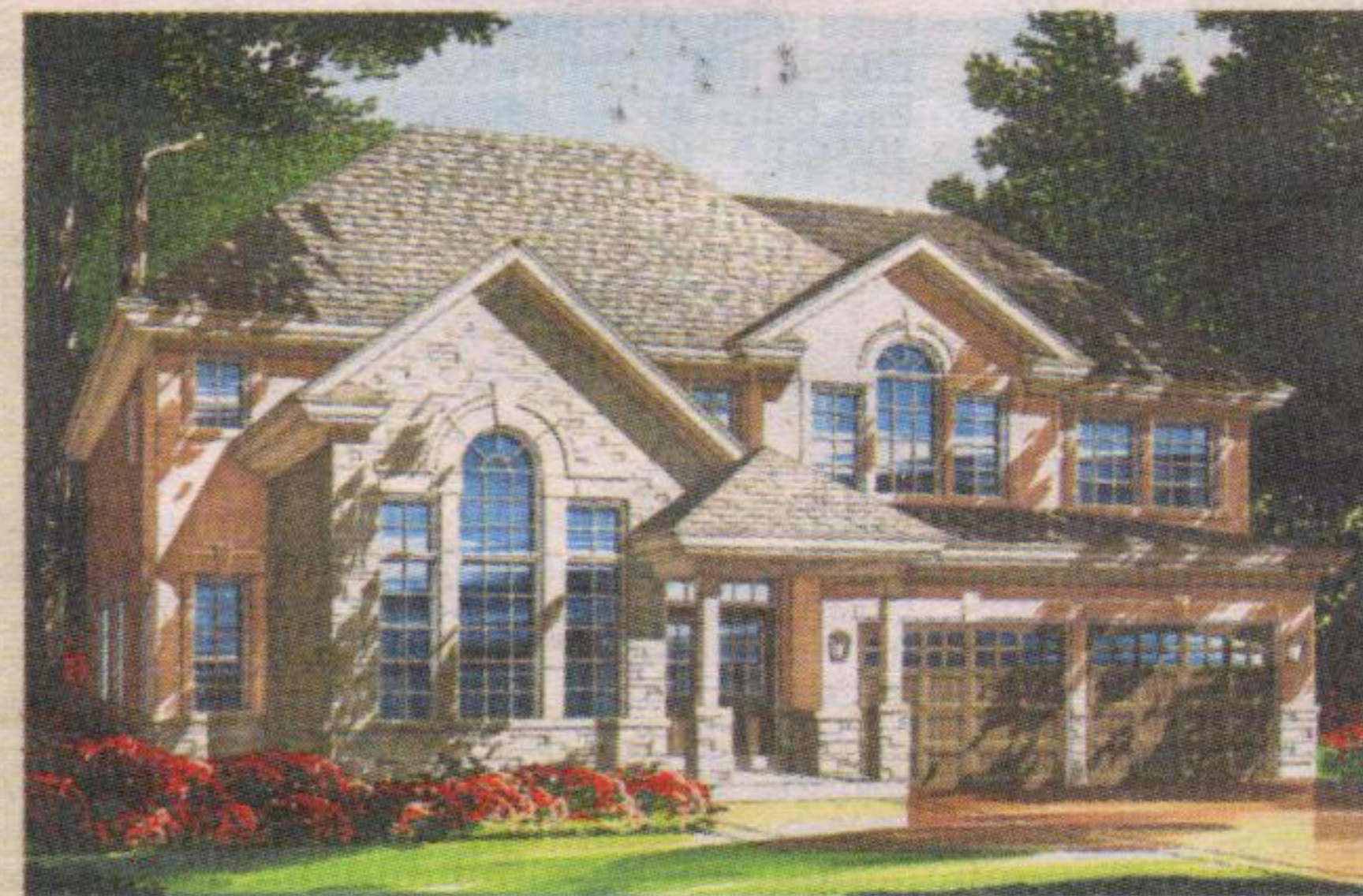
50' Home, The Coleridge 'C', 3,050 Sq.Ft. $410,990