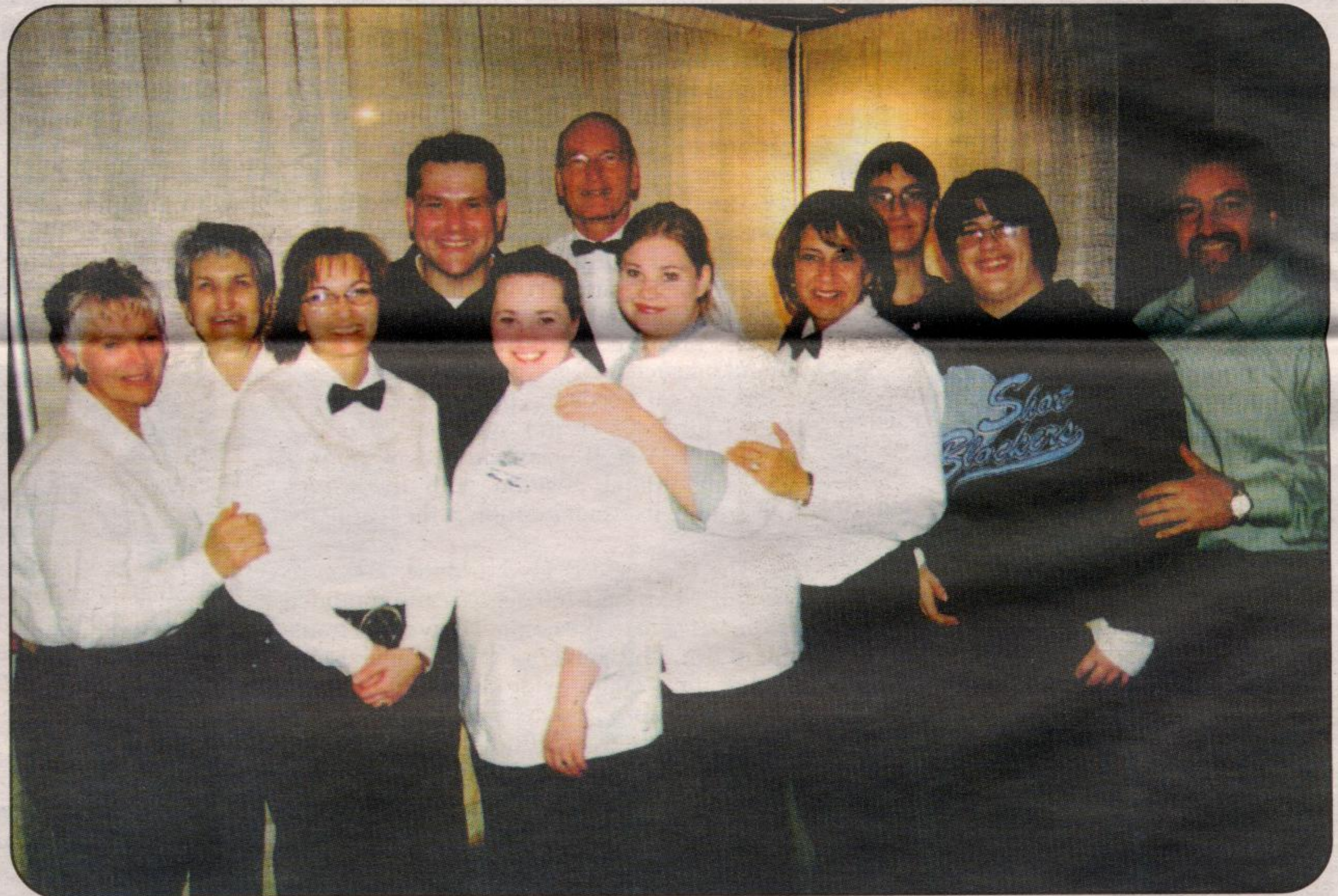
The hardworking volunteers of the Allison's of Milton team were a crucial part of the evening's success.