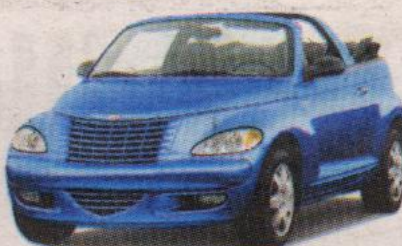
Chrysler PT Cruiser