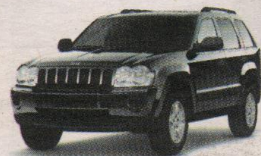
Jeep Grand Cherokee