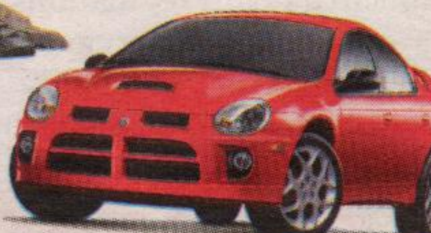
Dodge SX 2.0

GET 0% UP TO 72 MONTHS OR GET UP TO $7000* ON SELECTED MODELS† FACTORY TO DEALER ALLOWANCE