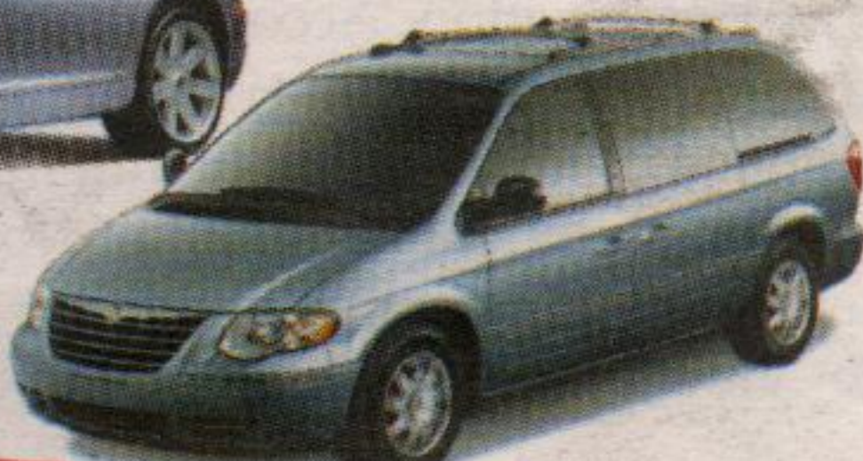
Chrysler Town & Country