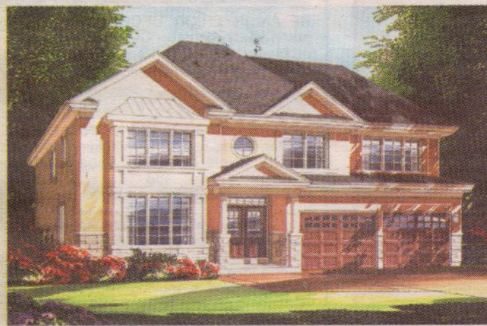
50' Home, The Brentfield 'C', 2,834 Sq. Ft. $395,990