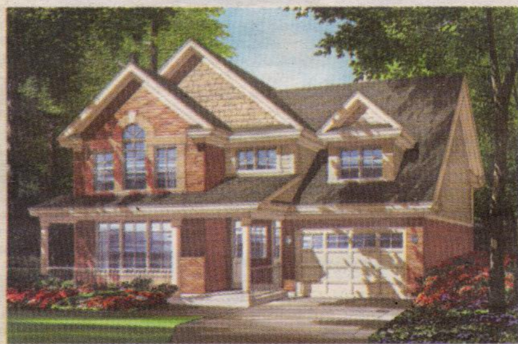
36' WideLot™, The Shady Glen 'A', 1,808 Sq. Ft. $287,990