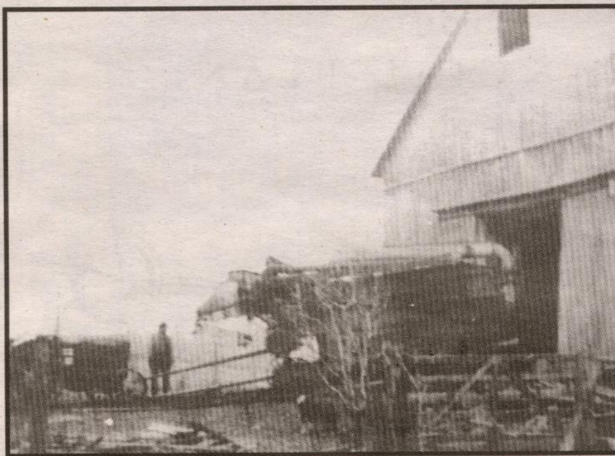
Nassagaweya S.S. No. 8, - 1921