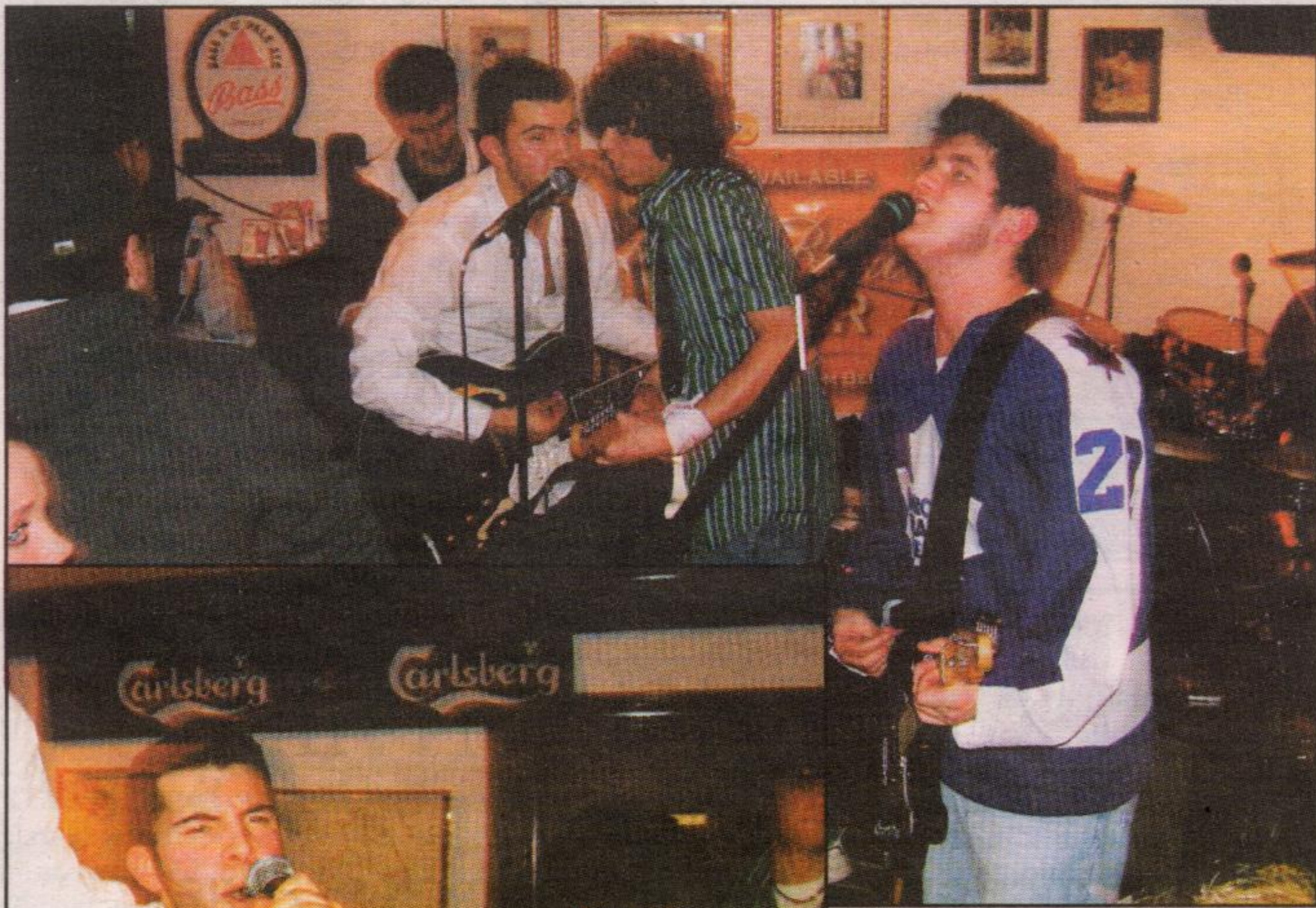
LTD smashes out a high energy performance engaging their fans in excitement