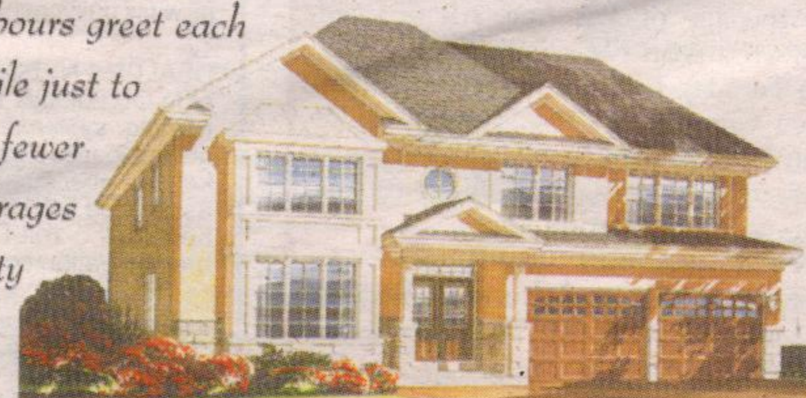
50' Home, The Brentfield 'C', 2,834 sq.ft. $395,990

In Hawthorne Village, the homes present a wide profile to the street and most offer front porches, which is a great family gathering place. Neighbours greet each other warmly and some stop out front for a while just to chat. Street traffic is lighter because there are fewer homes and the streets wind gently which encourages cars to drive slowly. Parkettes dot the community and serve as places where kids play. Biking and walking paths are also scattered throughout the community. Come and visit Canada's largest WideLot™ community, and see why its a place called home by more than 3,000 families.