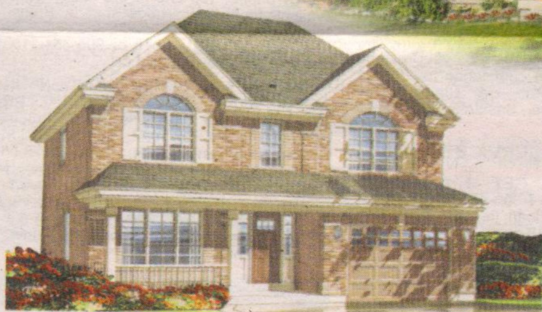
36' WideLot™, The Greensburg 'B', 1,648 sq.ft. $283,990

In Hawthorne Village, the homes present a wide profile to the street and most offer front porches, which is a great family gathering place. Neighbours greet each other warmly and some stop out front for a while just to chat. Street traffic is lighter because there are fewer homes and the streets wind gently which encourages cars to drive slowly. Parkettes dot the community and serve as places where kids play. Biking and walking paths are also scattered throughout the community. Come and visit Canada's largest WideLot™ community, and see why its a place called home by more than 3,000 families.