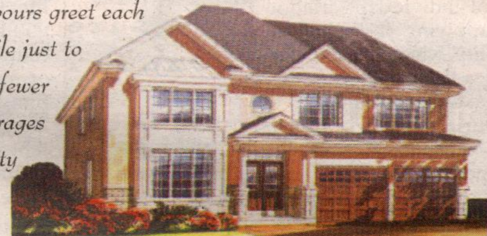
50' Home, The Brentfield 'C', 2,834 sq.ft. $395,990

In Hawthorne Village, the homes present a wide profile to the street and most offer front porches, which is a great family gathering place. Neighbours greet each other warmly and some stop out front for a while just to chat. Street traffic is lighter because there are fewer homes and the streets wind gently which encourages cars to drive slowly. Parkettes dot the community