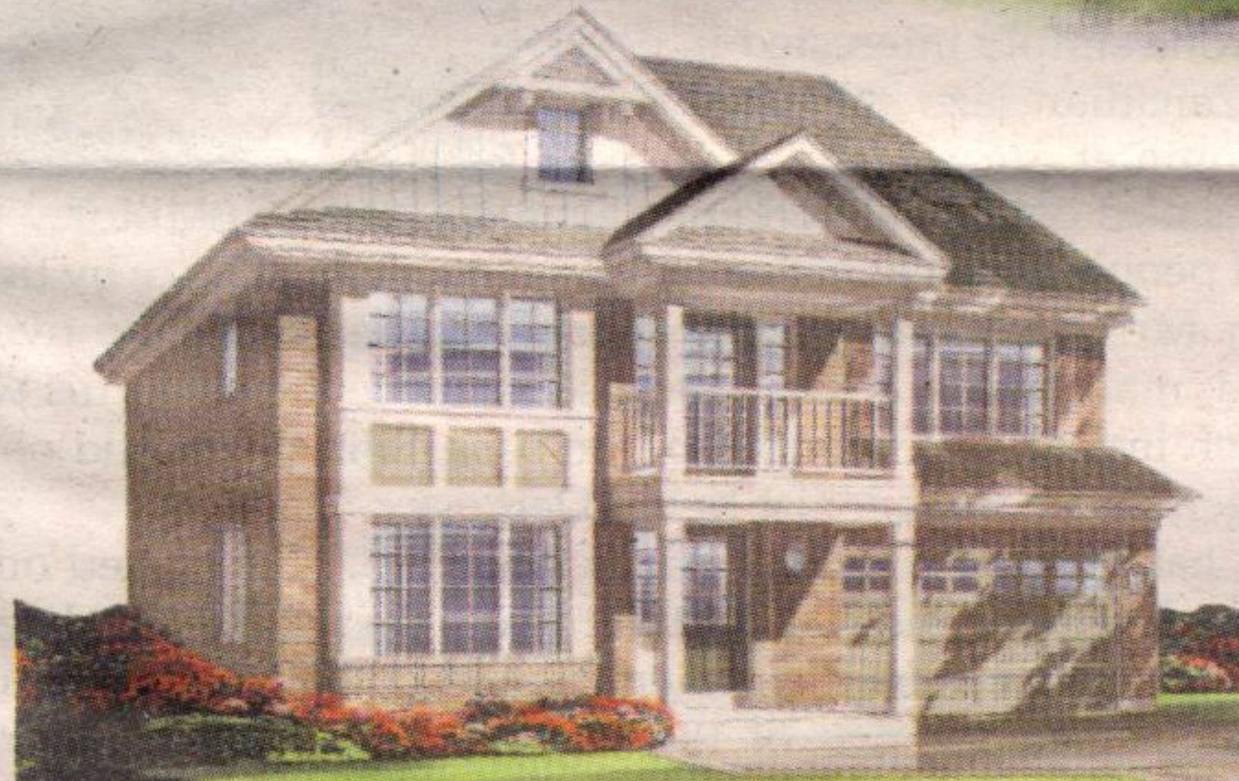
36' WideLot™, The Norriston 'E', 1,858 sq.ft. $290,990

and serve as places where kids play. Biking and walking paths are also scattered throughout the community. Come and visit Canada's largest WideLot™ community, and see why its a place called home by more than 3,000 families.