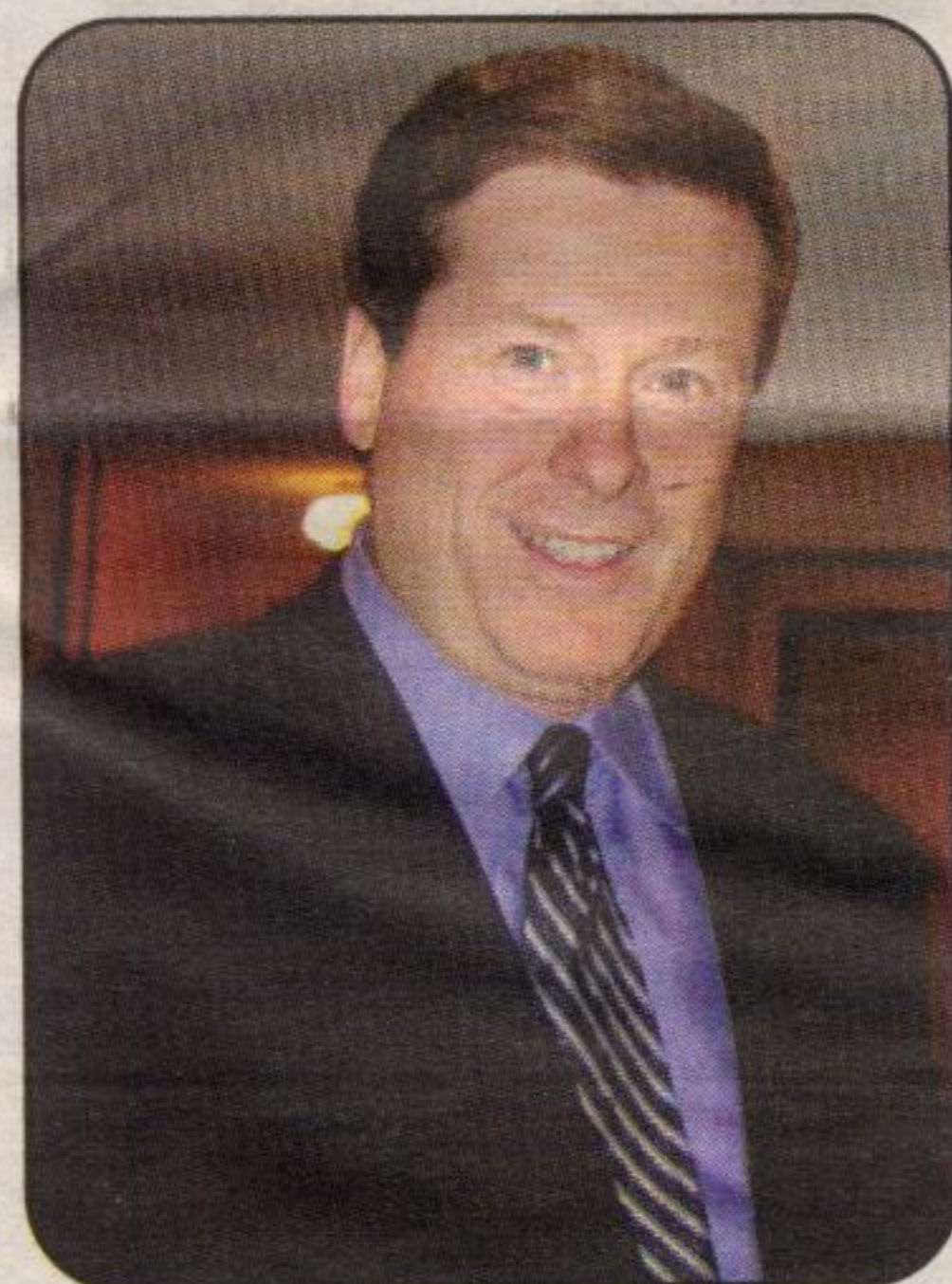
John Tory spoke to Conservative delegates and supporters at the North Halton Golf and Country Club in September before his election to head the Conservative Party of Ontario.