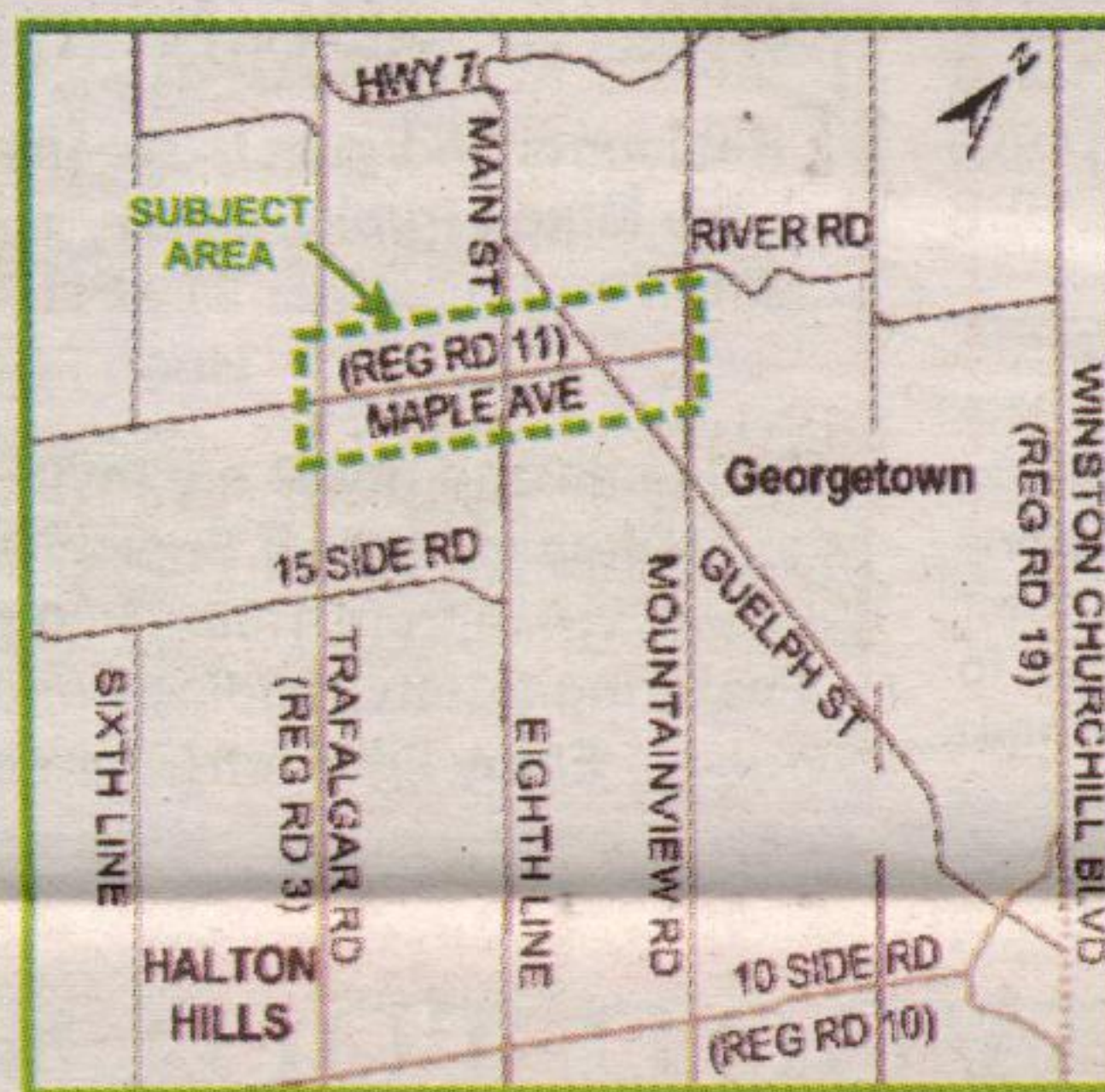
The map above shows the approximate limits of the study area.

Following recent Council direction, a bicycle path/multi-use pathway is being proposed to enhance the safety of cyclists along Maple Avenue from Trafalgar Road to Mountainview Road. To accommodate the cycle path/multi-use pathway, revisions have been made to the recommended design presented at the June 24, 2004 Public Information Centre (PIC). These revisions include changes to the sidewalk and boulevard layouts. Additional minor amendments have also been made to the other study recommendations presented at the same PIC.