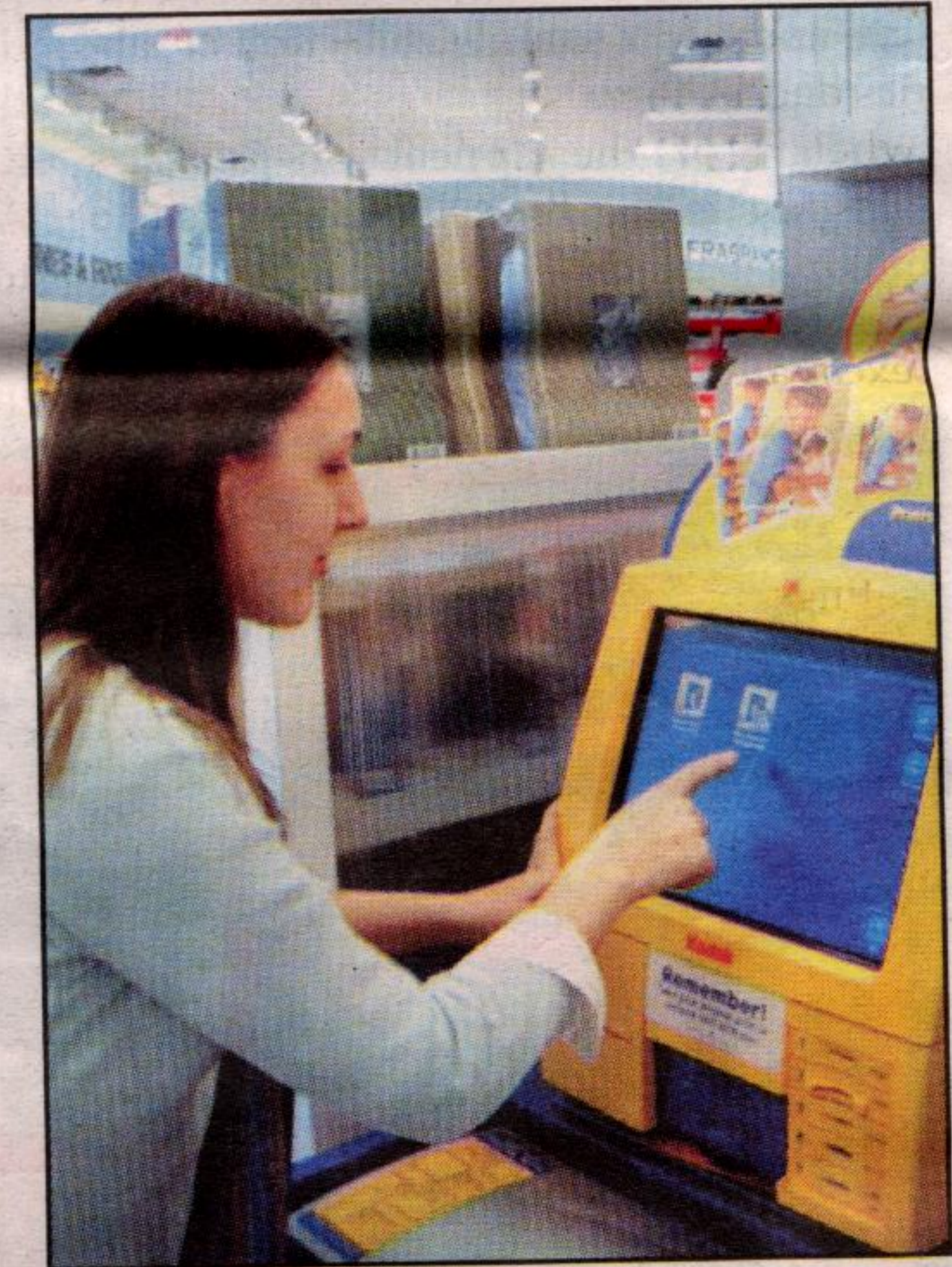
Checking out the Kodak Picture Makers in the Photo Lab.