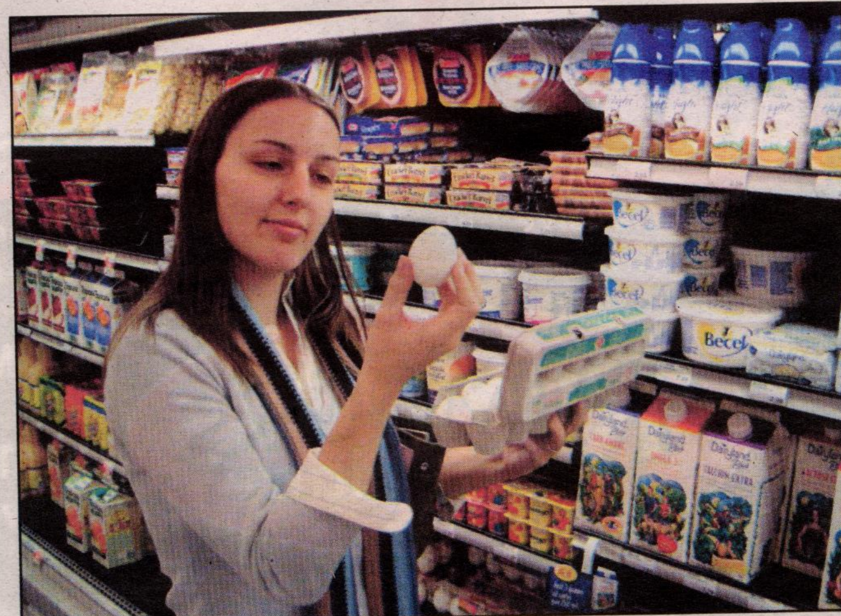
EGG-celent! A grocery section in a drug mart! This will help save time.