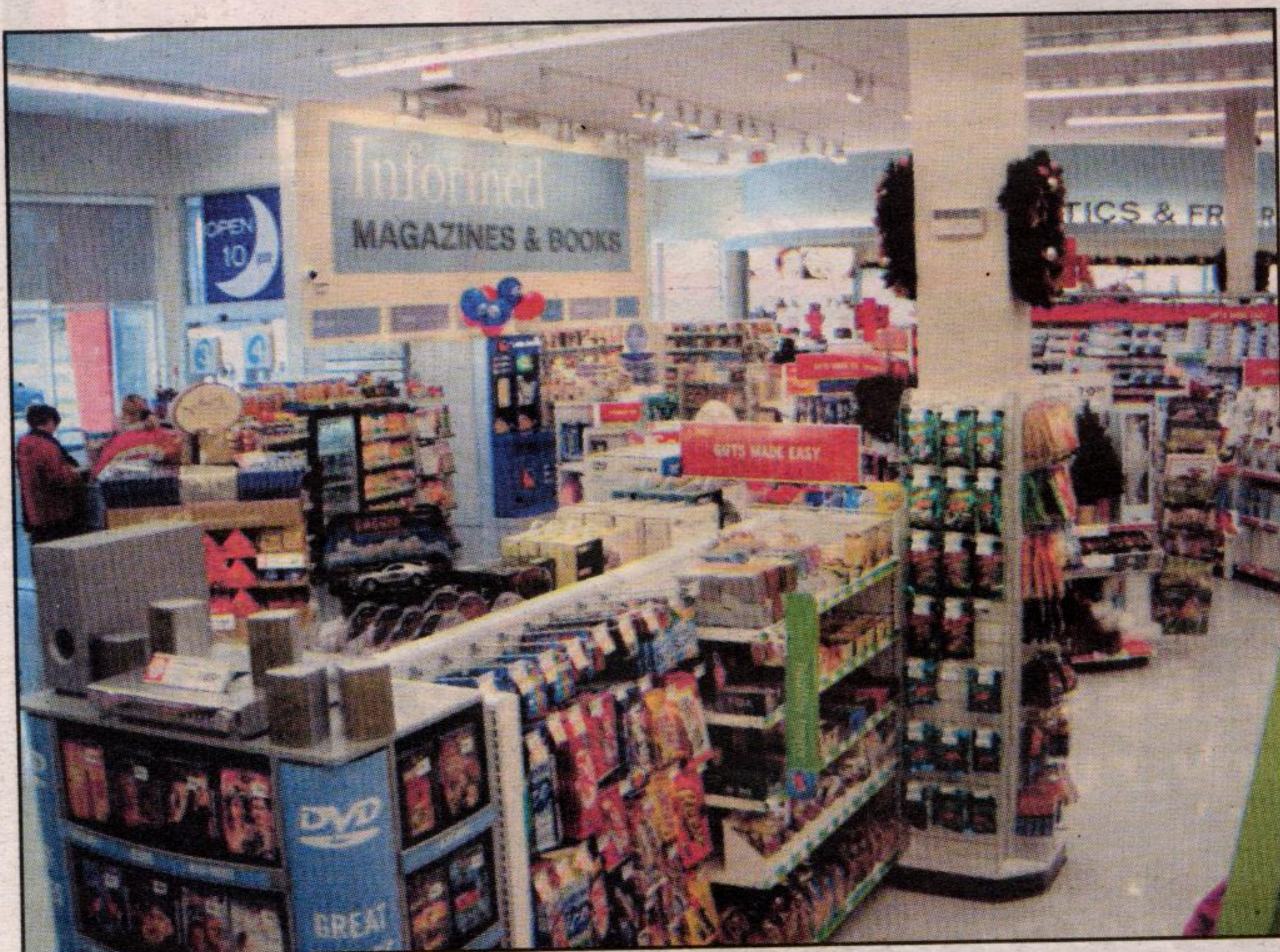
Inside shot of the main floor of Acton's Shoppers Drug Mart