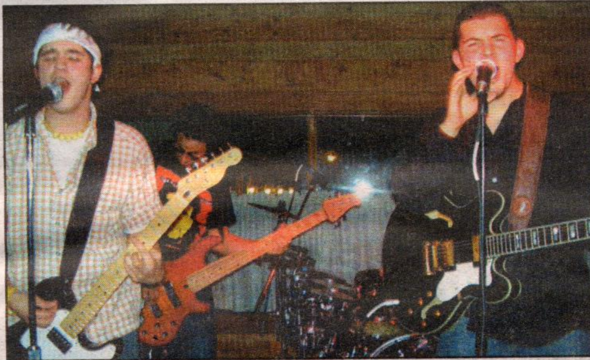
Wailing out into the crowd, LTD smashes on stage with electric energy.

You can check out more info on the band LTD at their website: www.lifetime-drive.com