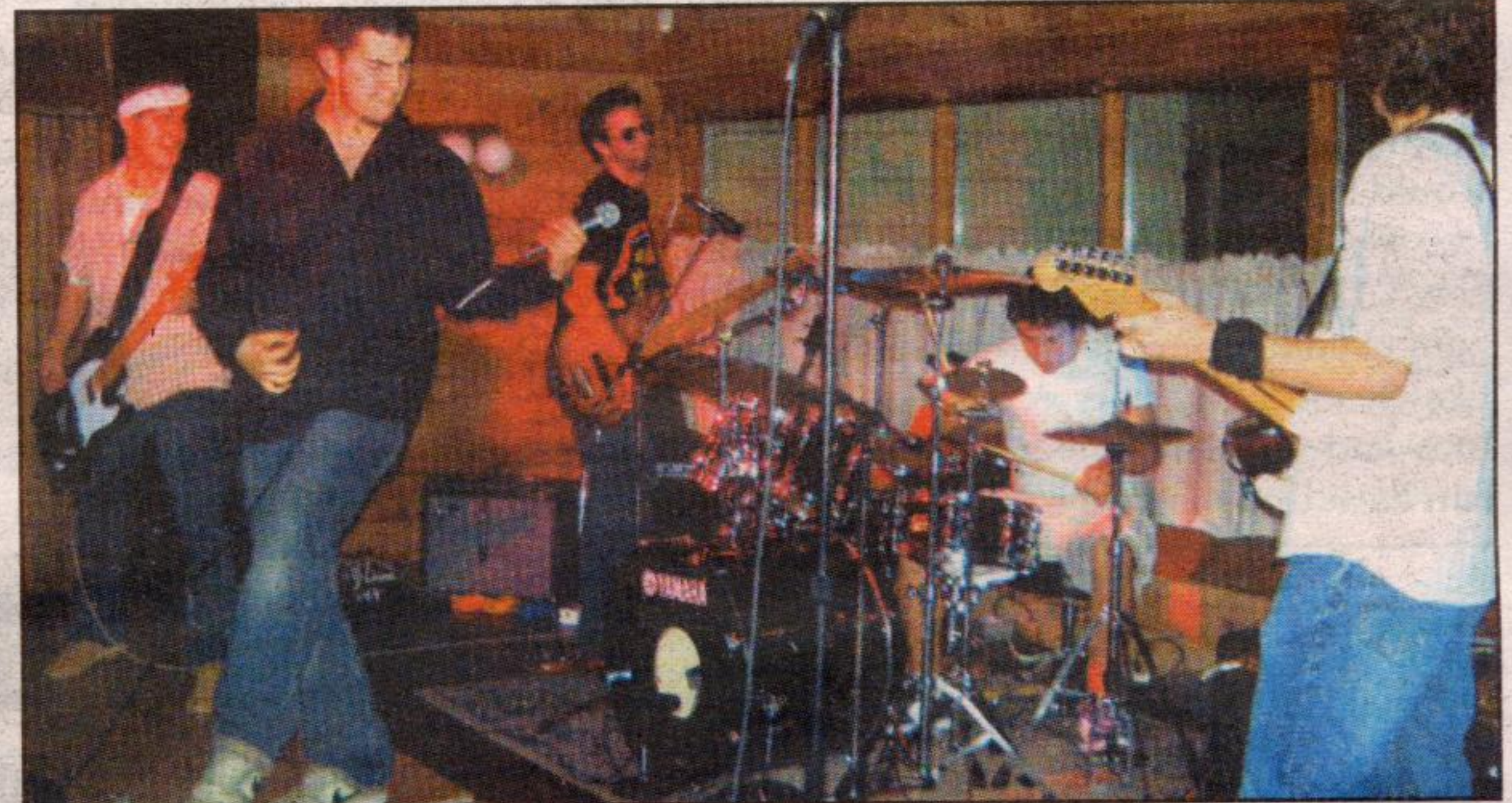
LTD in all of their musical glory