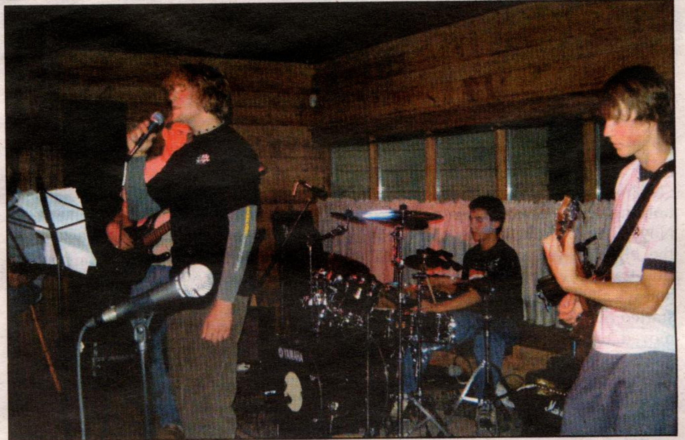
Opening act Classic Wave perform Never Stop, one of their originally written songs in their style of classic rock.