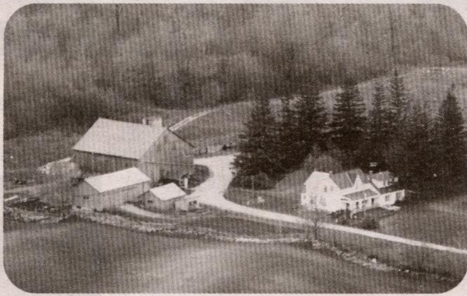
Lot 27 Con. 4 ~ 1974 ~

Affiliated with N.F Insurance Agency Inc.