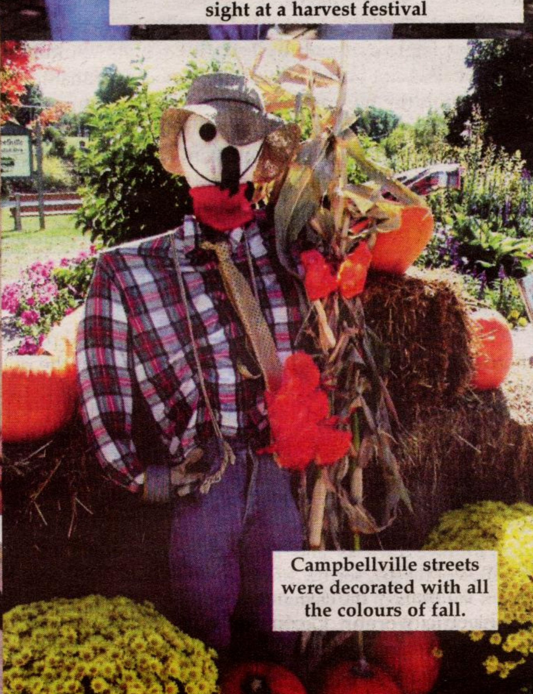
Campbellville streets were decorated with all the colours of fall.