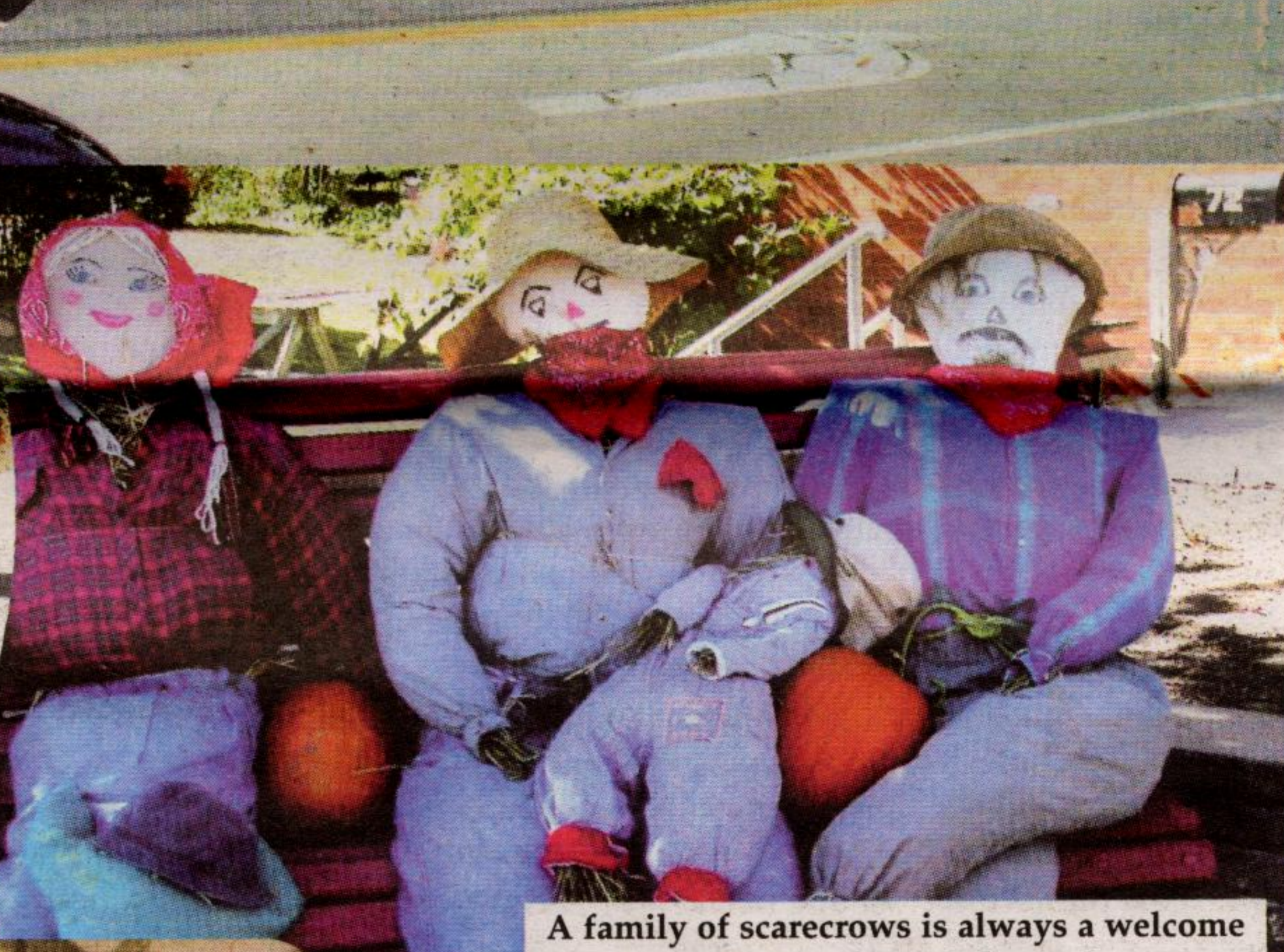
A family of scarecrows is always a welcome sight at a harvest festival