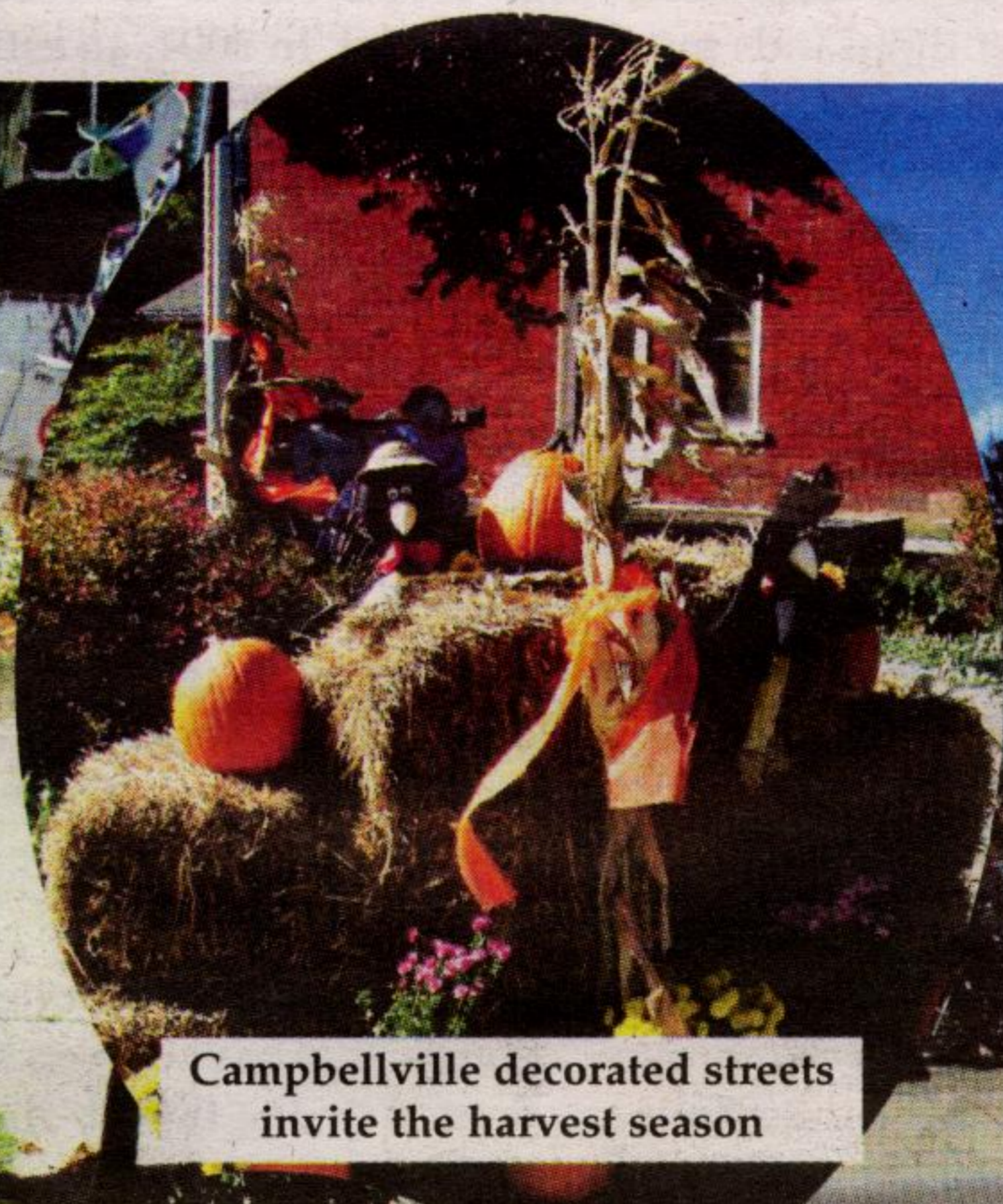
Campbellville decorated streets invite the harvest season