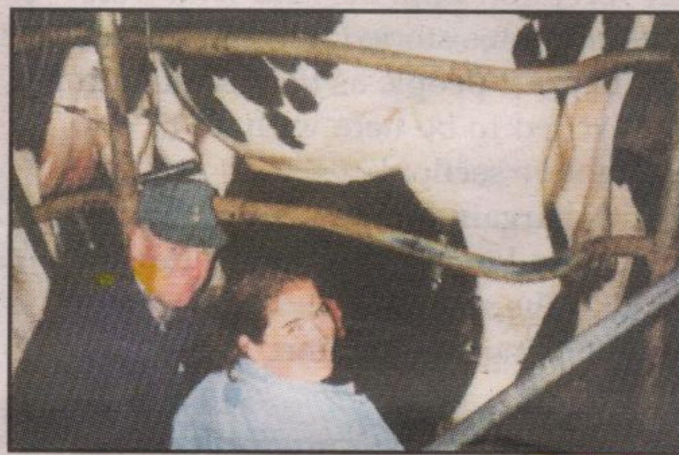
A holstein is a holstein anywhere in the world.

I hope that one day soon I can go back and see everyone that I met. I want to thank the Junior Farmers Association of Ontario for giving me this wonderful opportunity. And I would like to thank my sponsors for all of their support!