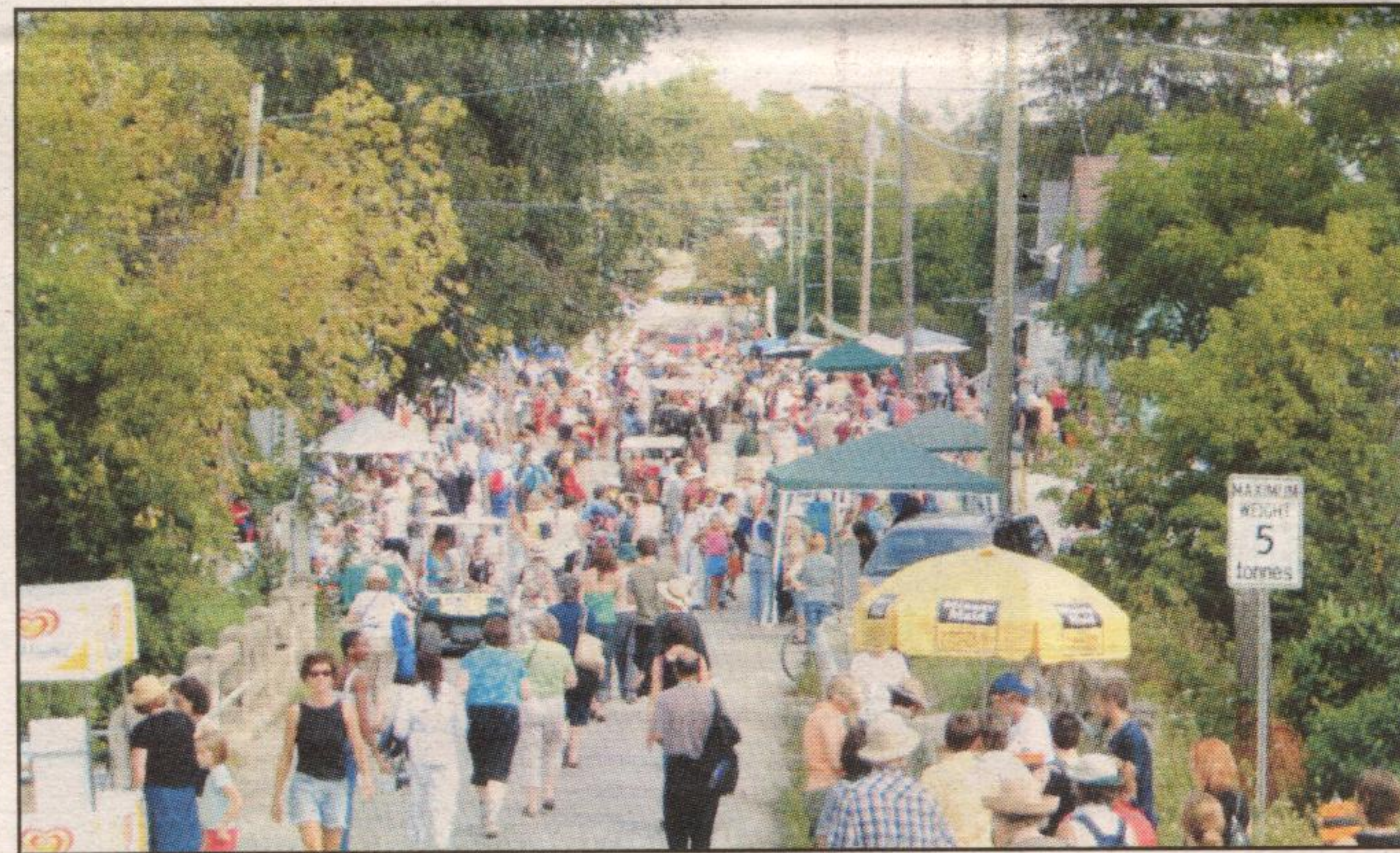
The Main Street of Eden Mills is filled to overflowing with over a thousand Festival attendees.