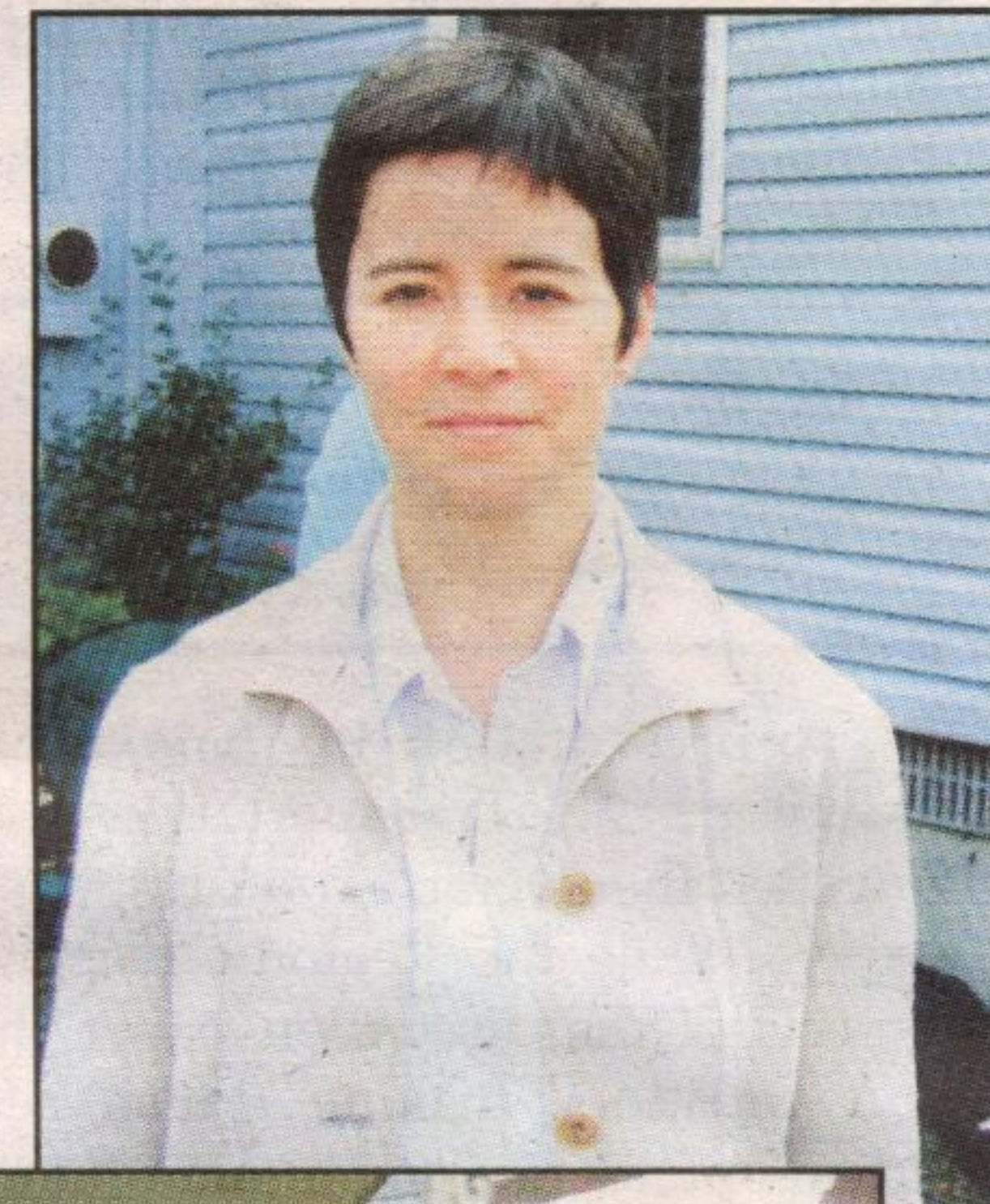
Celebrated author and actress, Anne Marie MacDonald read from her acclaimed novel The Way of the Crow .