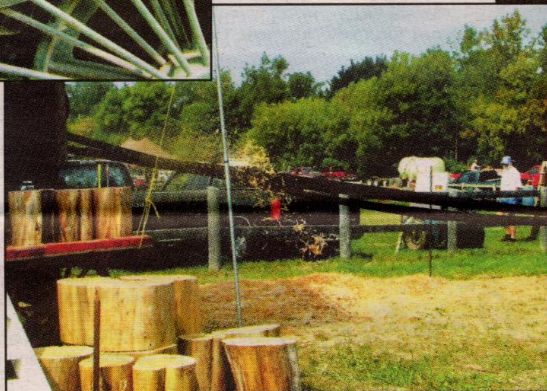
Wood Chips spew forth from the Shinglemilla Operation Display from one of the Steam Powered Wood Chippers.

It was a chance for yesterday's generation to slip down memory lane as well as a chance for the younger generation to catch a glimpse at a way of life almost lost with the march of growing technology.