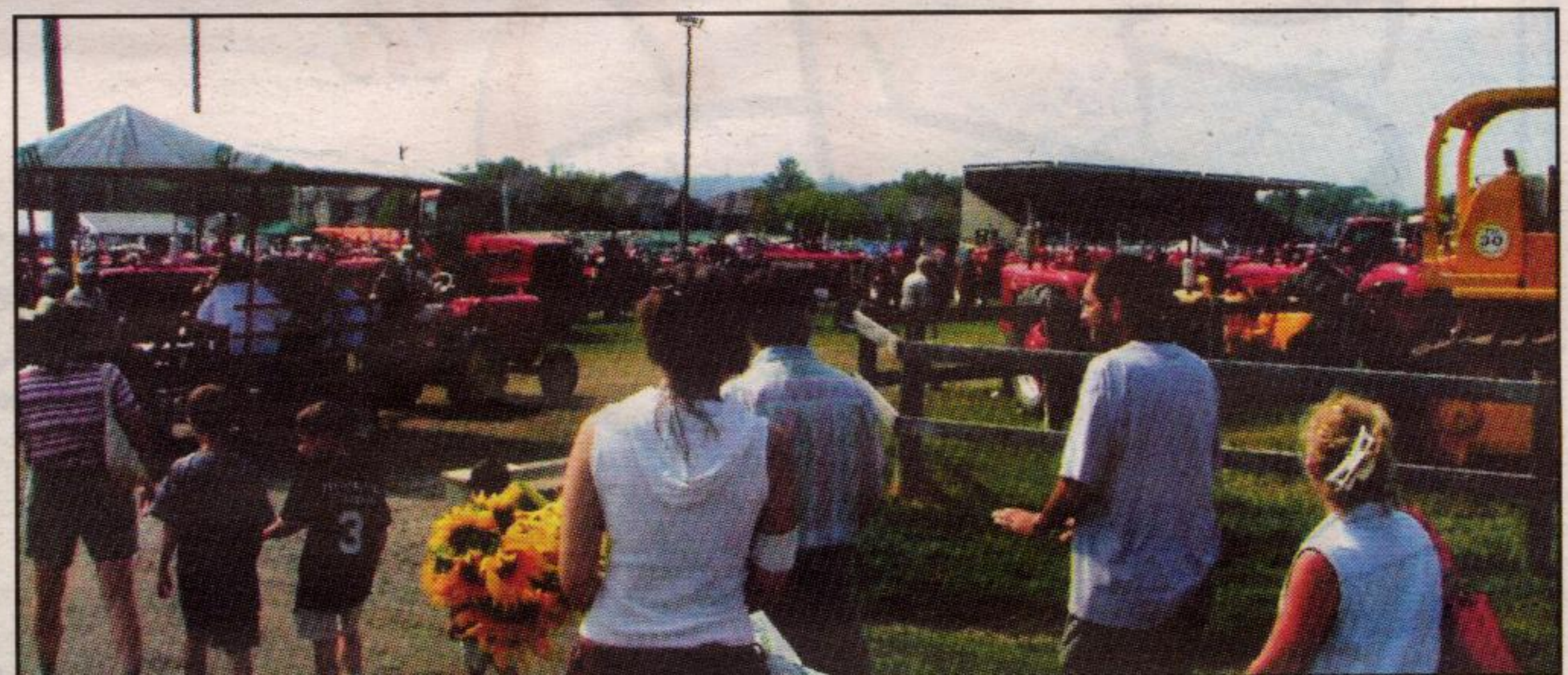
Friends and families flock to enjoy the wonders of the past brought to the present.