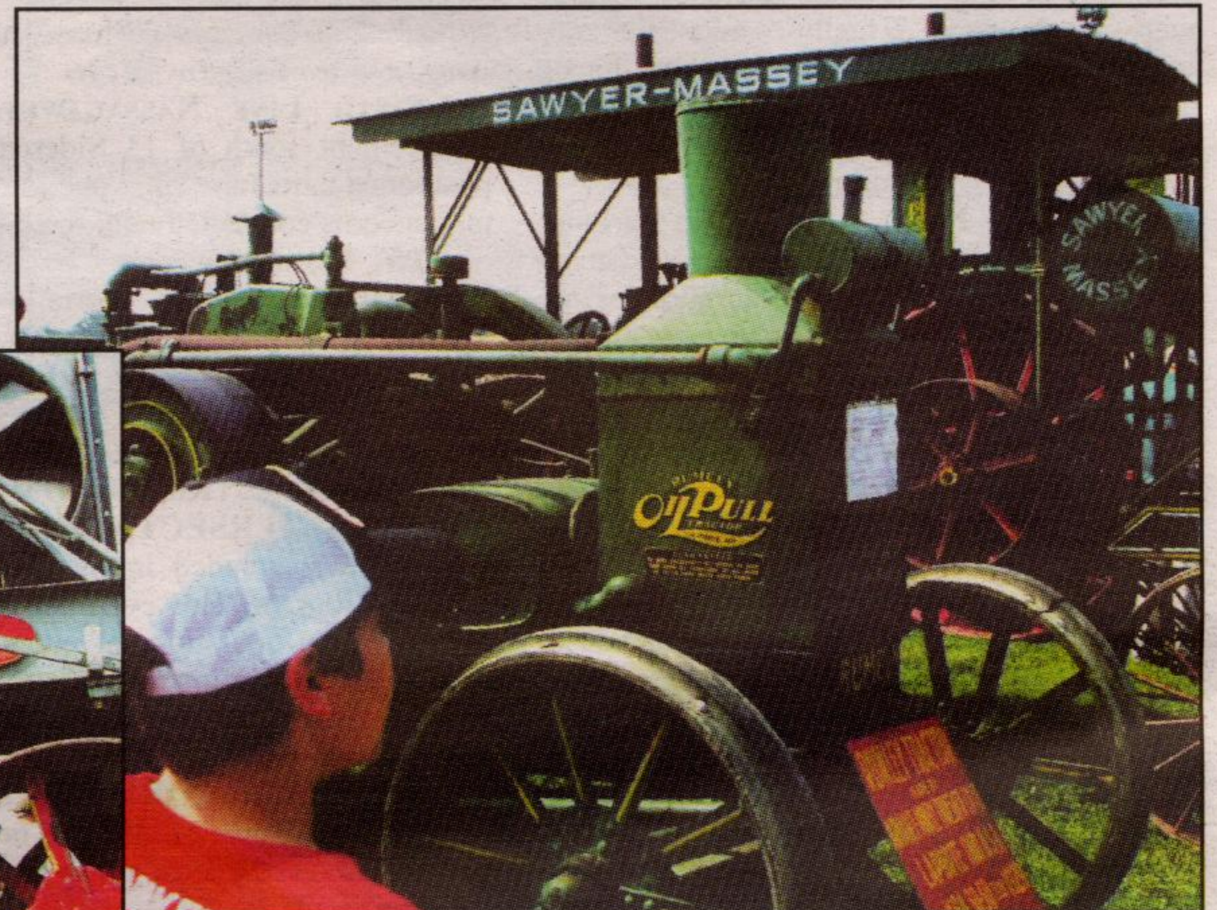
The antique Rumely Oil Pull Tractor attracted a lot of attention.