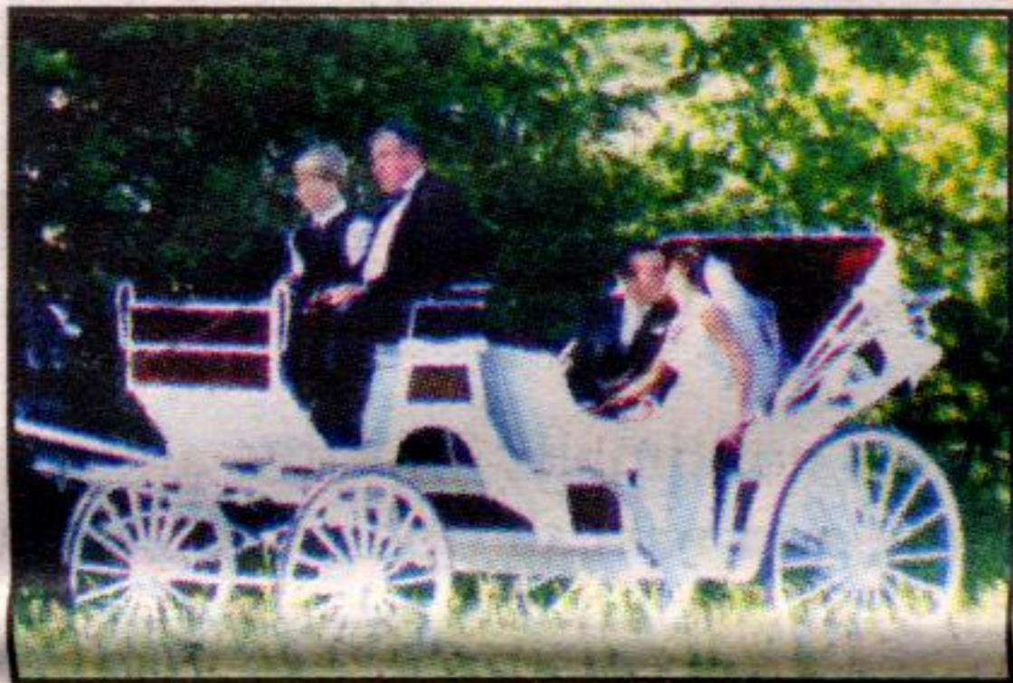
Country Heritage Park offers a lot of services for wedding parties, including the use of a landau owned by local residents Bill and Jill Stokes. Here a bride and groom take a ride in the landau around the park.

When couples use the Gambrel Barn, an impressive 4000-square-foot facility constructed of white pine and featuring high ceilings, they can hold their wedding services in the upper section of the barn, in what is known as the loft, and the reception in a spacious area in the lower level of the building. Pictures don't pose a problem either, as Ms. Roach says the site offers a lot of scenic